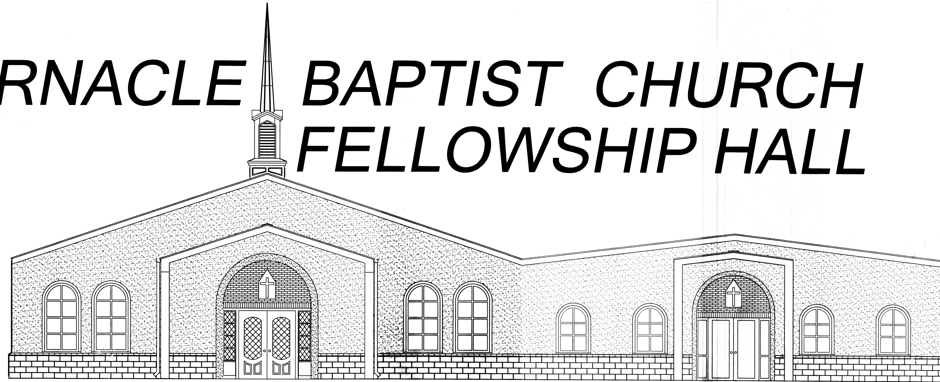
EXISTING FRONT-EAST ELEVATION