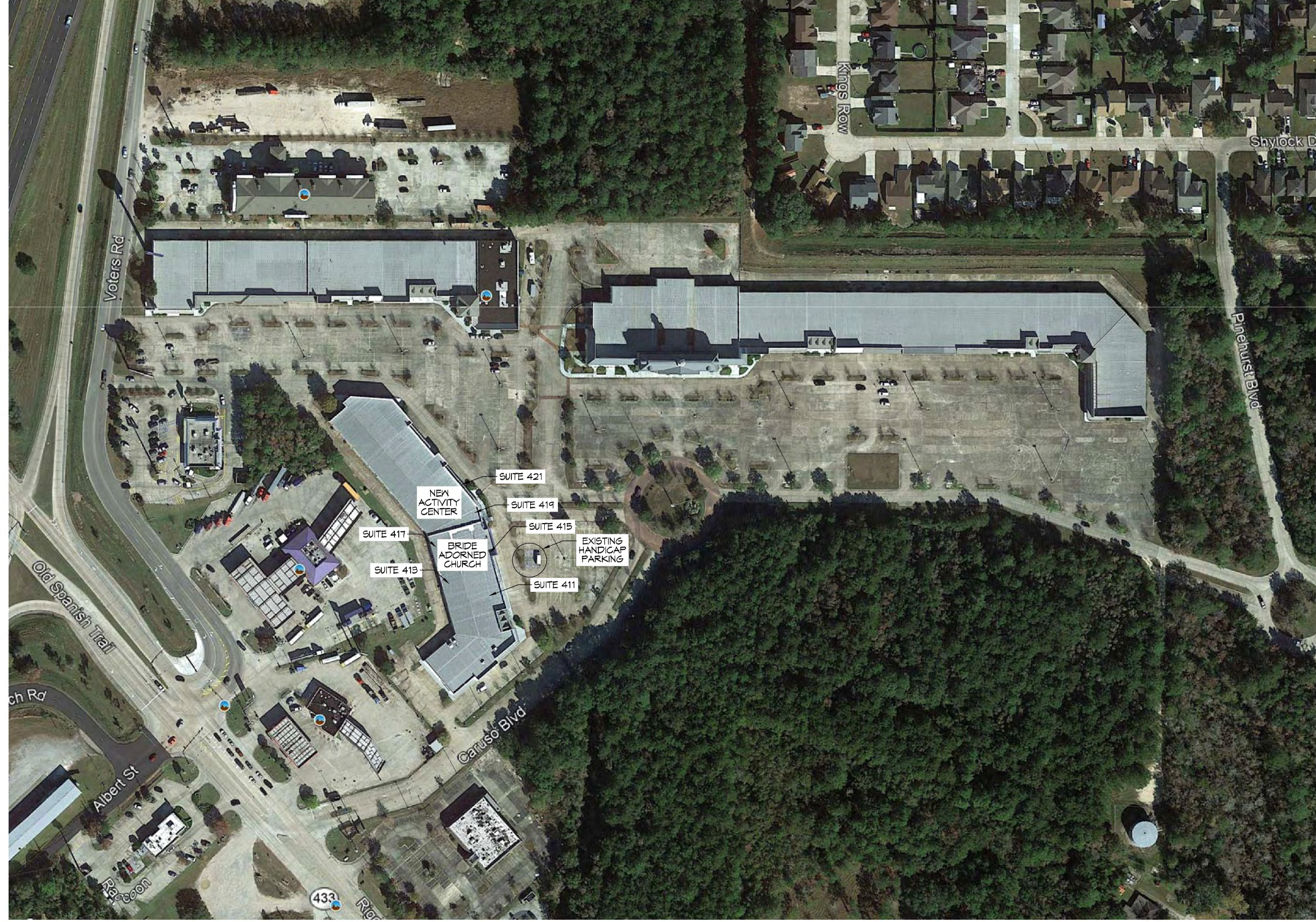
2 SITE PLAN SCALE: 1/128"=1'-0"

FILE NAME: J:\PROJECTS\2021\20210601\20210601_001_SIT PLAN.dwg DATE: Thursday, June 3, 2021 11:20:09 AM