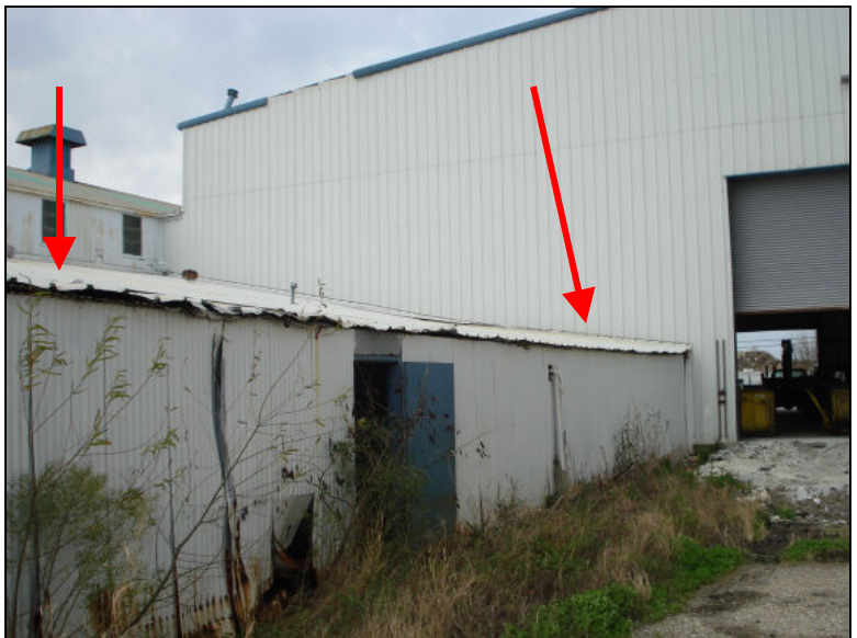
15. Missing eave and rake trim also down spout.