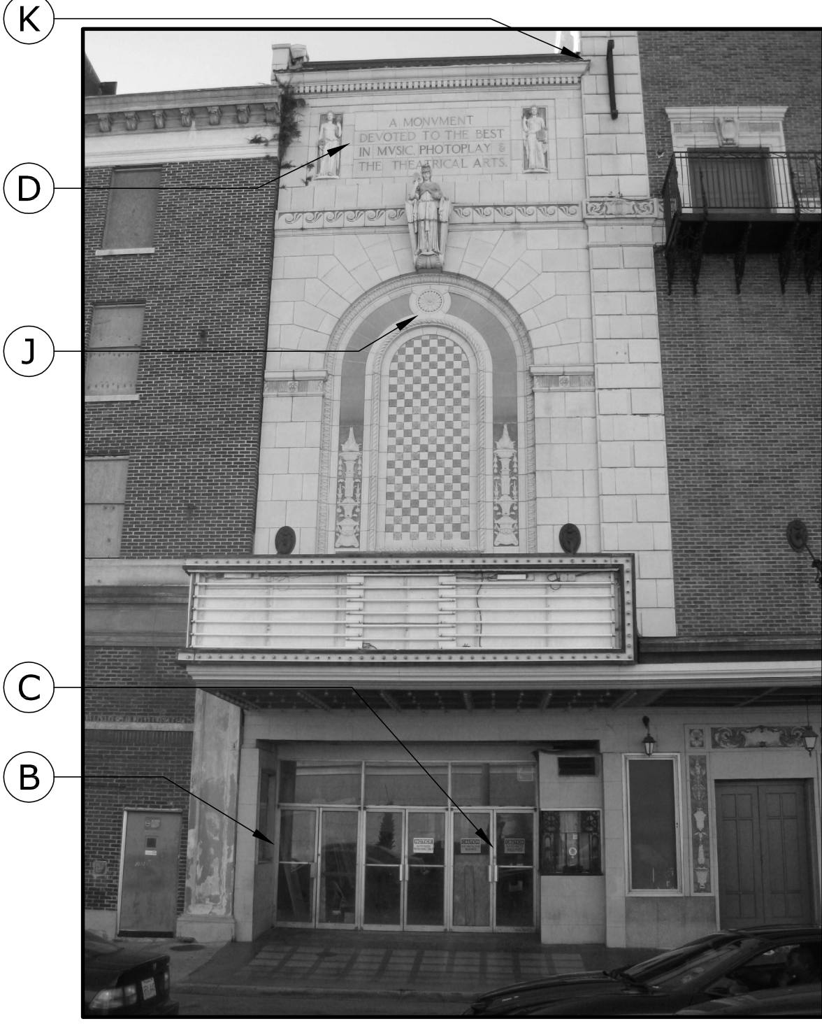
A PHOTO 0579 GENERAL ELEVATION OF SIDE ENTRANCE, RAMPART STREET