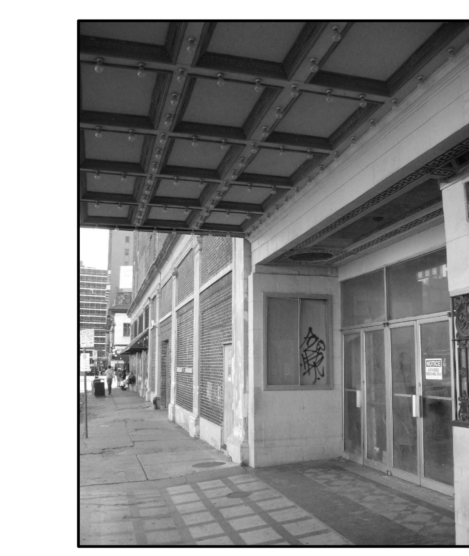
B PHOTO 0583 LEFT WALL OF RAMPART ST. ENTRANCE NOTE THERE IS A HIDDEN TERRA COTTA WALL BEHIND THE STUCCO