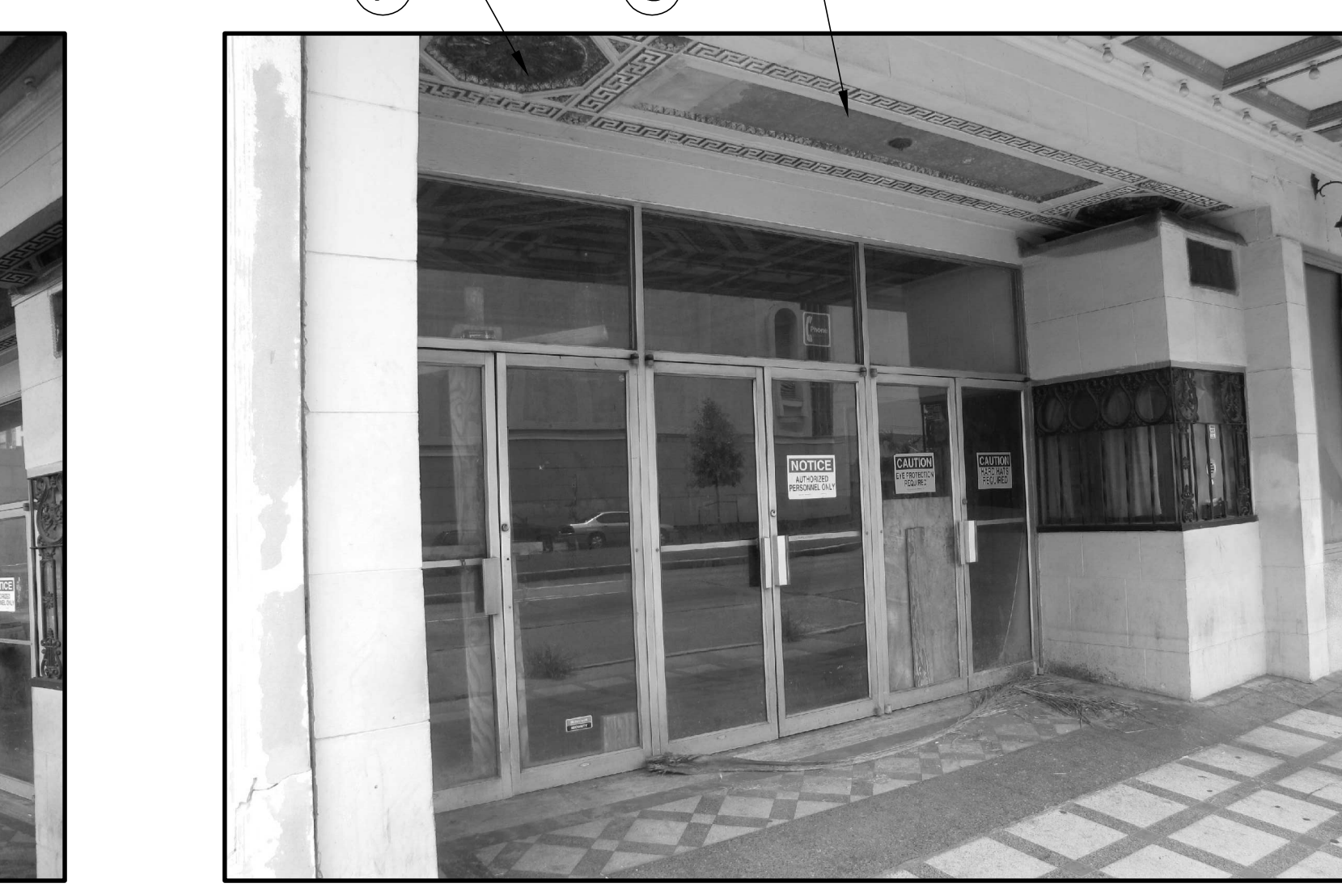
C PHOTO 1436 RAMPART ST. ENTRANCE AND TICKET BOOTH - NOTE ORIGINAL TERRA COTTA CEILING, RESTORE