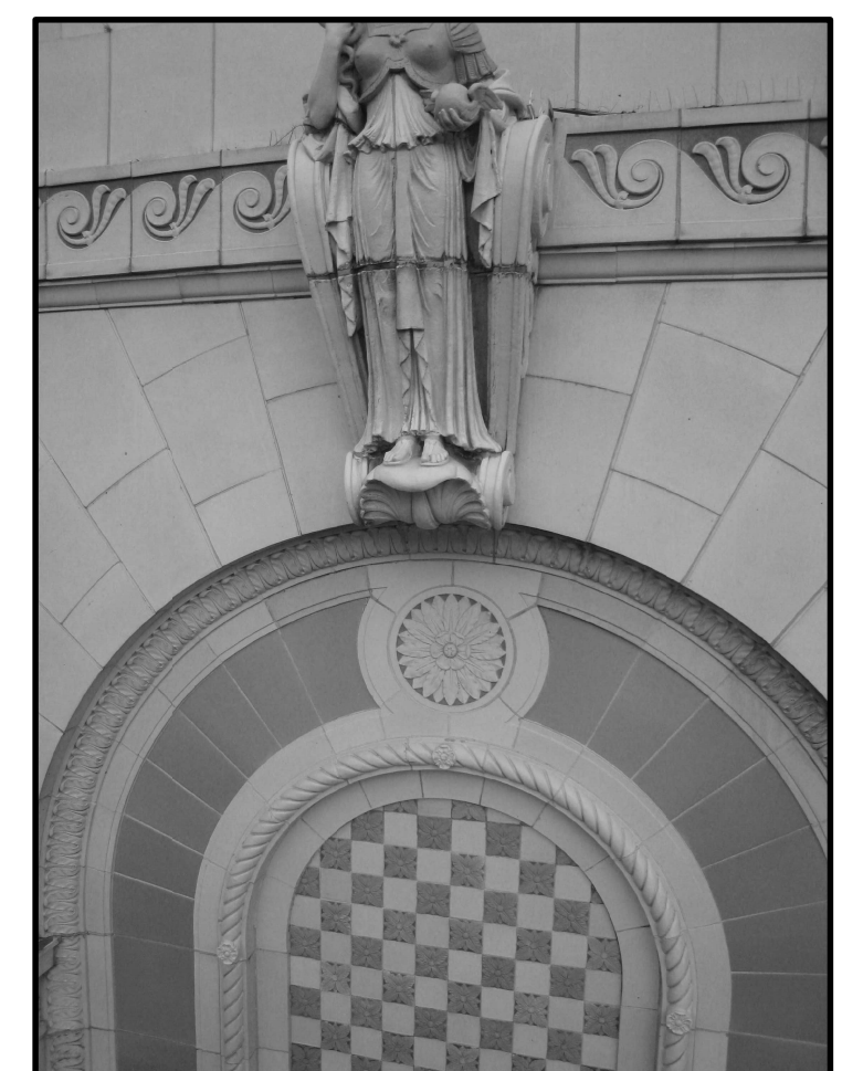
J PHOTO 1874 SCULPTURAL DETAIL ABOVE RAMPART ST. ENTRANCE - CHECK FOR CONDITION AND SECURITY