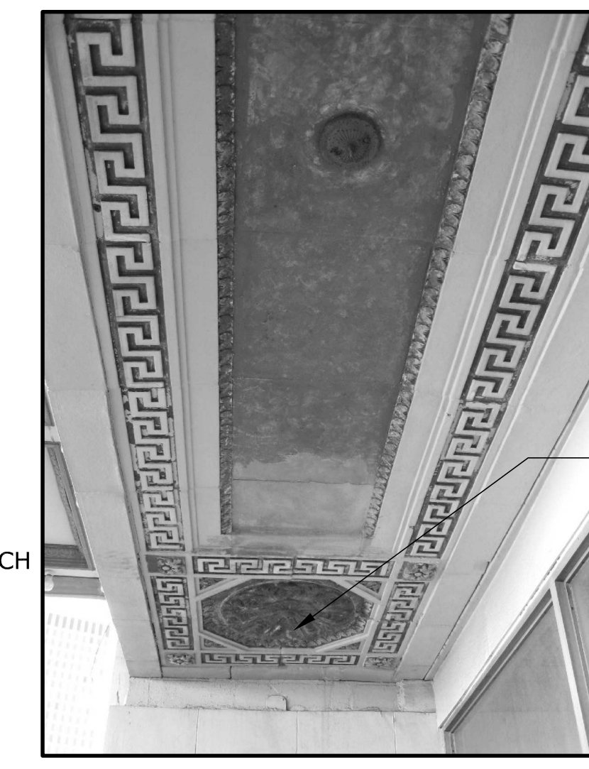
G PHOTO 0585 RAMPART ST. ENTRANCE CEILING - NOTE BAD PATCHES, REPAIR TO MATCH EXISTING