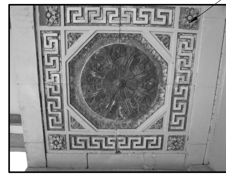
F PHOTO 1635 RESIN MEDALLION TO BE REPLACED IN RAMPART ST. ENTRANCE CEILING - TO MATCH EXISTING LOCATED ABOVE THE EXISTING TICKET BOOTH