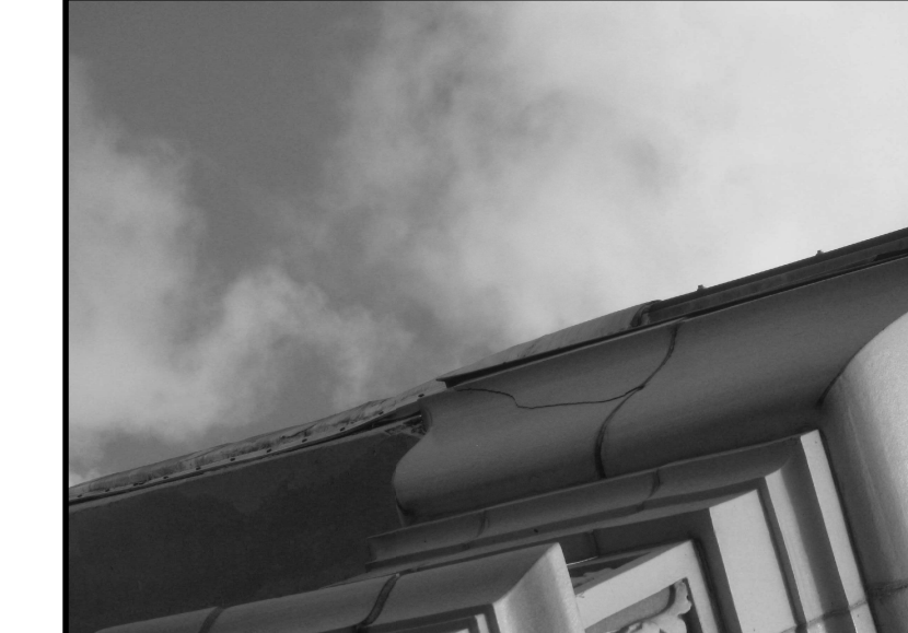
K PHOTO 1851 CRACKS IN CORNICE AT SOUTHERN CORNER OF RAMPART ST. FACADE - CHECK HANGERS, REPAIR AND REPLACE AS NECESSARY

THE SAENGER THEATRE RENEWAL PROJECT 142 North Rampart Street New Orleans, LA Client Saenger Theatre Redevelopment Company 200 West Loop South, Suite 1040 Houston TX 77027 Architect MARTINEZ+JOHNSON ARCHITECTURE 1412 Eye St. NW Washington, DC 20005 202.333.4480 Structural Engineer Lundy & Franke Engineering 540 Helmer Road, San Antonio TX 78232 210.979.7900 Theatre Consultant Schuler Shook 123 Third Street North #210 Minneapolis, MN 55401 612.339.9598 Acoustical Engineer Akustiks 93 North Main Street South Norwalk, CT 06854 202.299.1904 MEP Engineer JBA Consulting Engineers, Inc. 3525 N. Cassinway Blvd., Suite 500 Metairie, LA 70002 504.830.0139 Civil Engineer Linfield, Hunter, & Junius, Inc. 3608 18th Street Suite 200 Metairie, LA 70002 504.833.5300 Architectural Historian EHT Traceries, Inc. 1121 Fifth Street NW Washington, DC 20001 202.393.1199