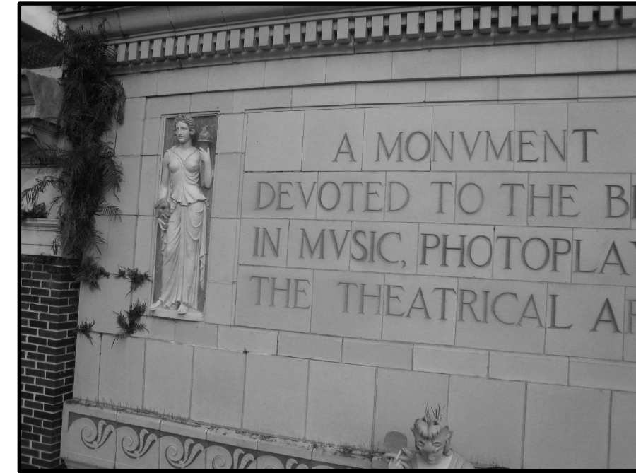
D PHOTO 1856 DETAIL OF SCULPTURAL TERRA COTTA AND ENGRAVING ABOVE SIDE ENTRANCE