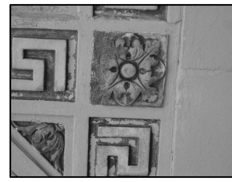
E PHOTO 1634 DAMAGED TILE IN CEILING OF RAMPART ST. ENTRANCE, REMOVE PAINT AND RESTORE ORIGINAL GLAZING AND ROSETTES AND KEYS