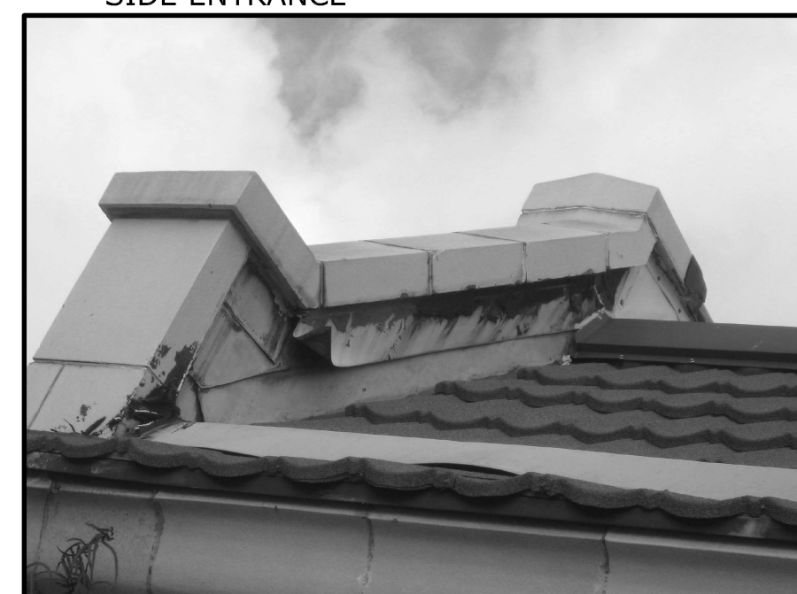
H PHOTO 1868 TERRA COTTA RIDGE CAPS ON ROOF PARAPET - NOTE CLEAN OFF ALL ROOFING MATERIALS AND ALL STAINS