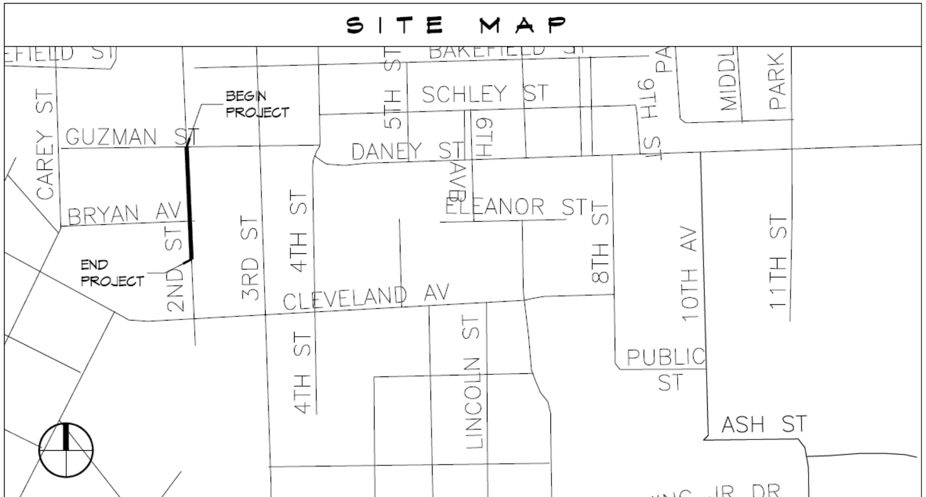
SITE MAP CDBG SIDEWALKS AND DRAINAGE IMPROVEMENTS ON 2ND STREET – PHASE II Project 5000-36