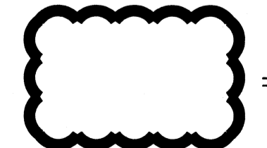
UTILITIES PLAN SCALE: 1"=20'-0"