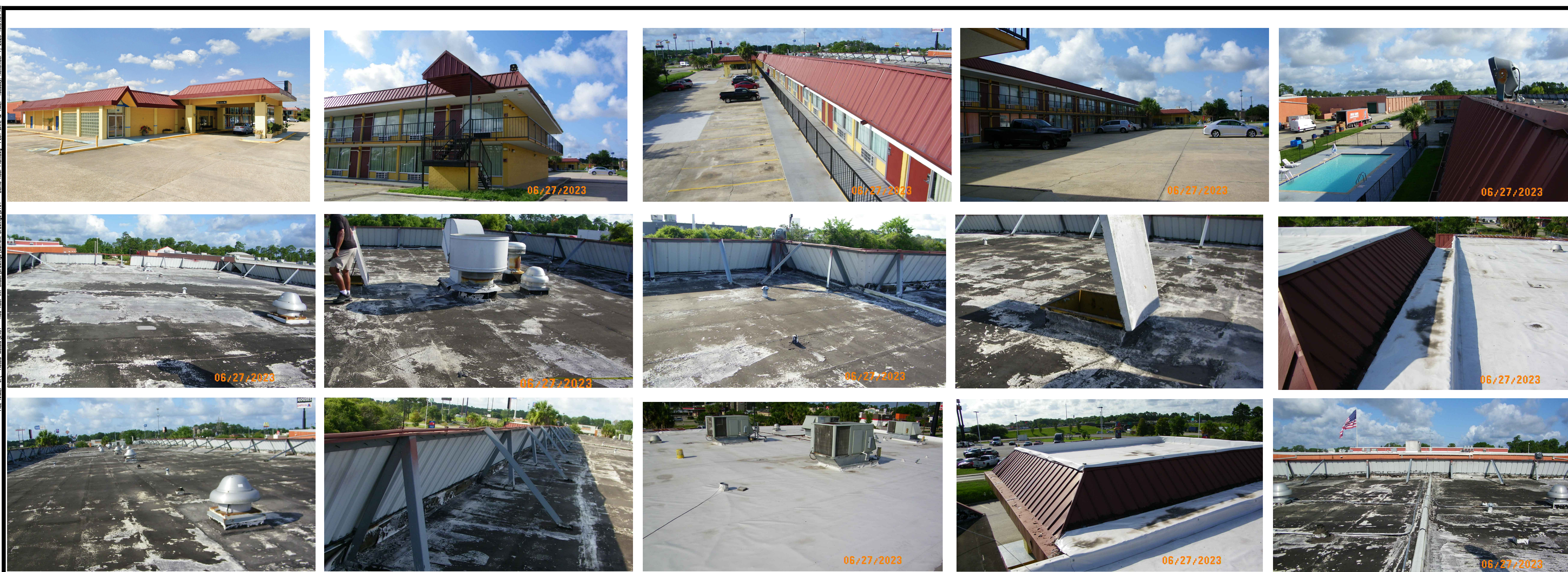
1 EXISTING ROOF-PICTURES FOR REFERENCE SCALE: N.T.S.