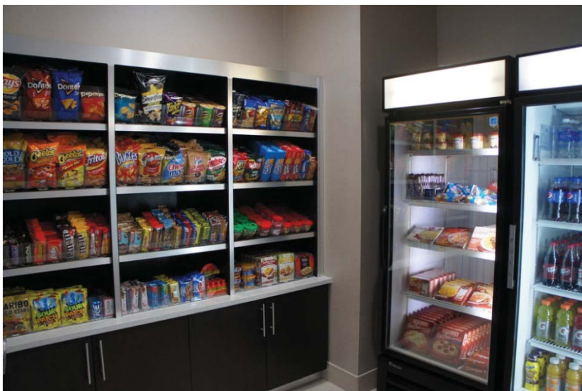
Sundry Shelving 08/03/15 ID SPECS

List of merchandise items will be provided by Franchise Operations/ Franchise Service Director and purchased items to come from one of the above referenced vendors.