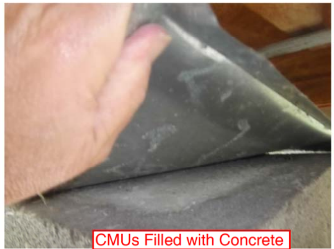
CMUs Filled with Concrete