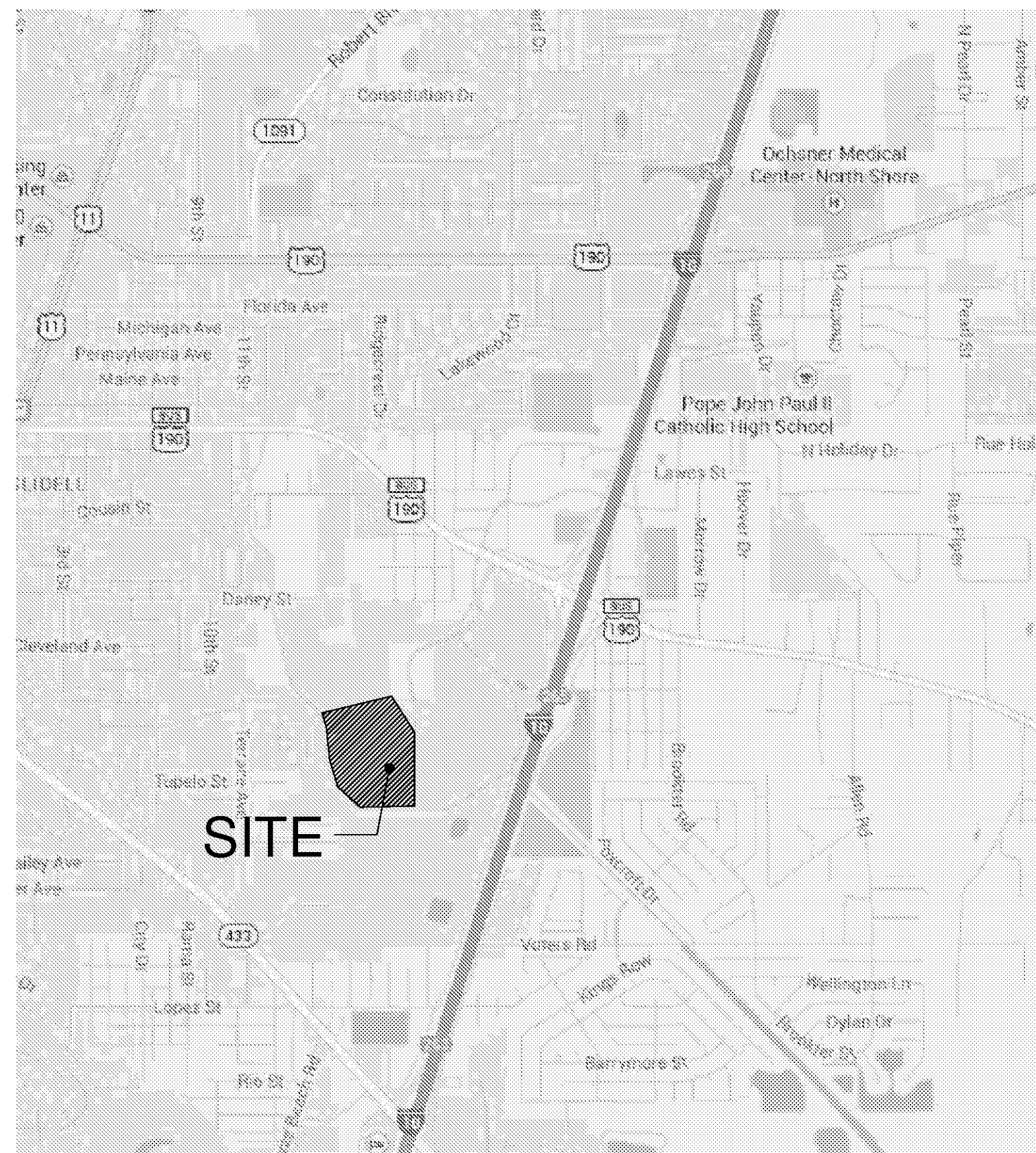
2 VICINITY MAP SCALE: N.T.S.

NORTH TERRACES 400 PERIMETER CENTER TERRACE SUITE 650 ATLANTA, GEORGIA 30346