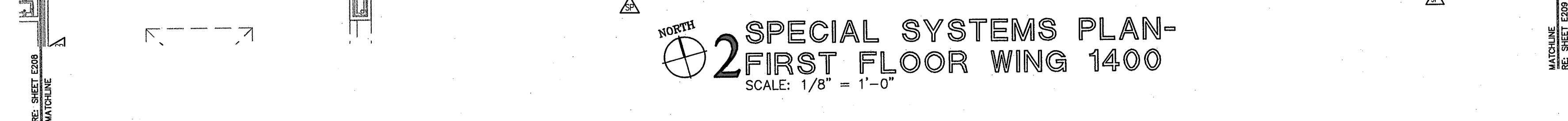
2 SPECIAL SYSTEMS PLAN- FIRST FLOOR WING 1400 SCALE: 1/8" = 1'-0"