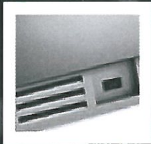
UNDER-COUNTER ICE MAKER E15IM60EBS