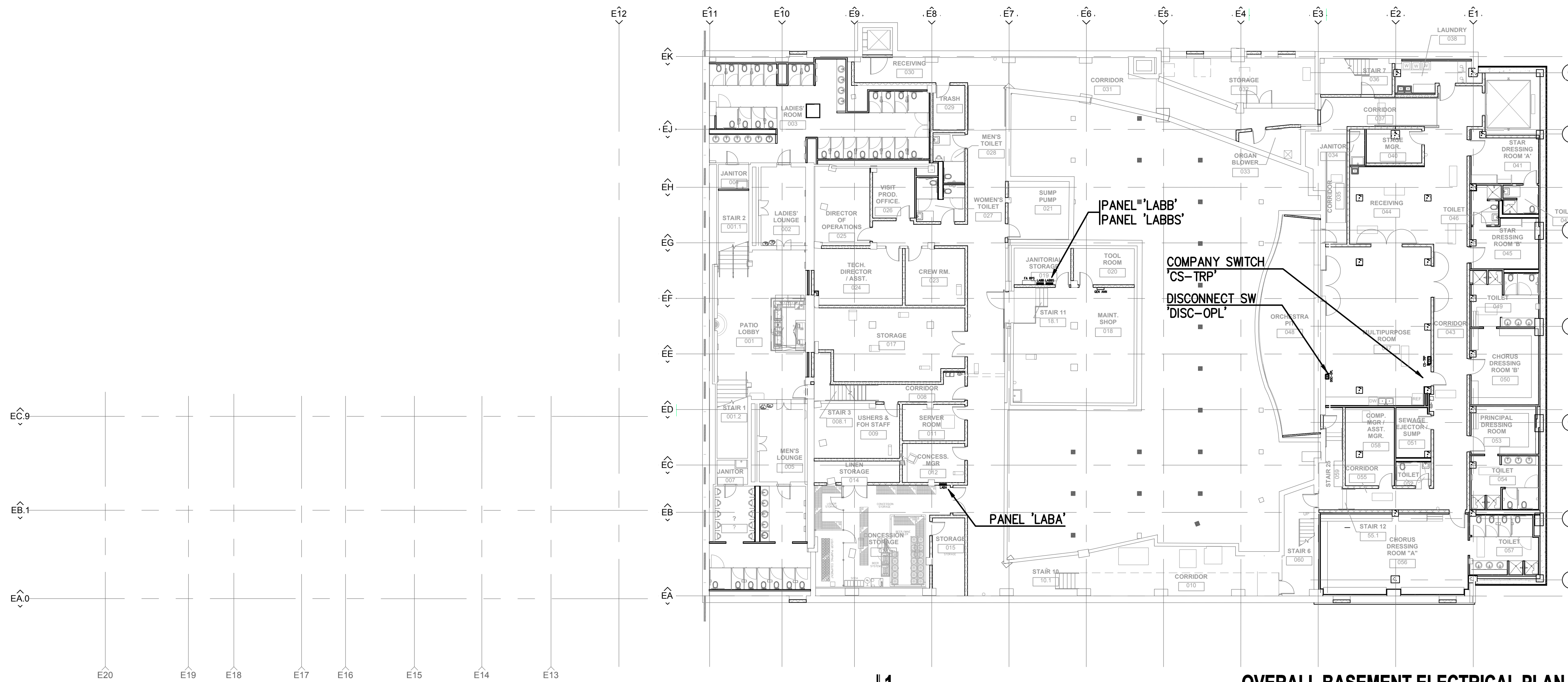
1 FN: 090394_E010.DWG OVERALL BASEMENT ELECTRICAL PLAN SCALE: 1/16" = 1'-0"