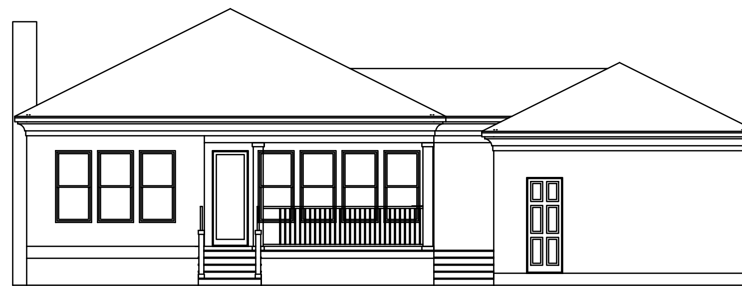
REAR ELEVATION SCALE 1/8" = 1'-0"