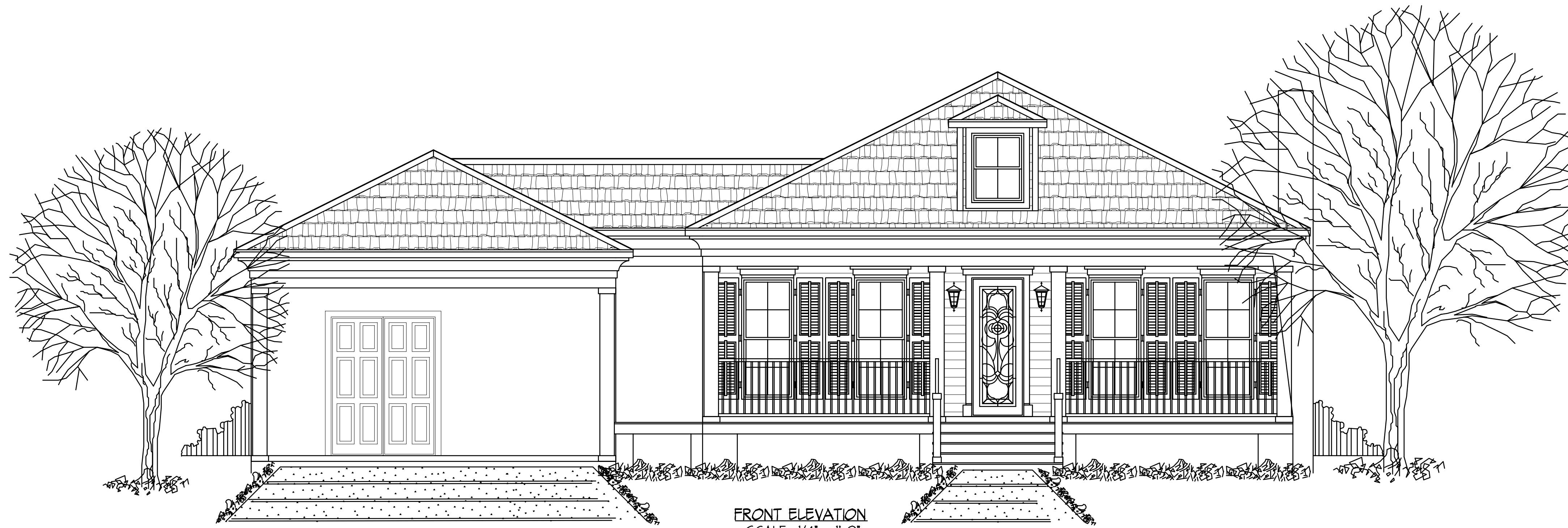
FRONT ELEVATION SCALE 1/4" = 1'-0"