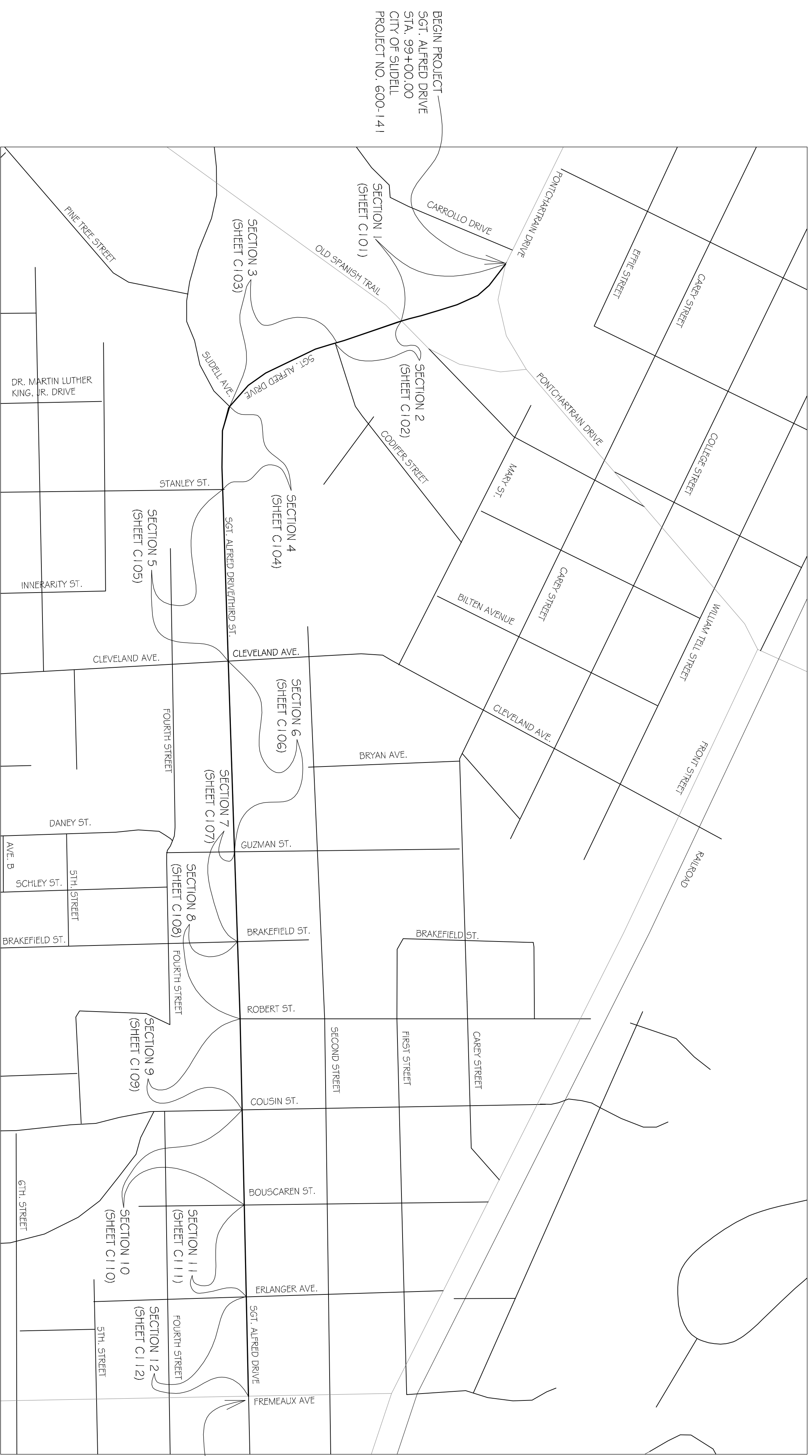
PROJECT LOCATION MAP SCALE: 1" = 40'-0"

END PROJECT SGT. ALFRED DRIVE STA. 157+21.04 CITY OF SLIDELL PROJECT NO. 600-141