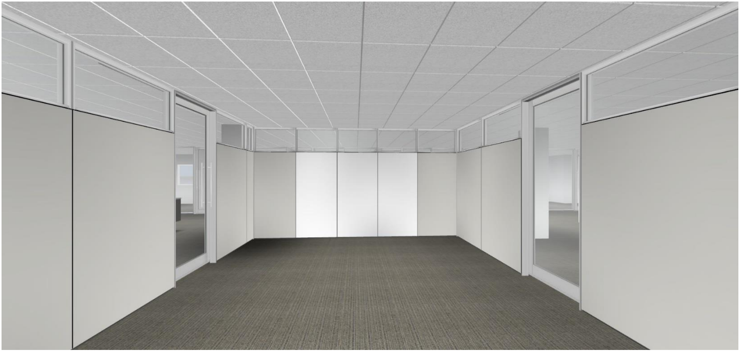
Inside Conference Room (Magnetic Markerboard on one end)