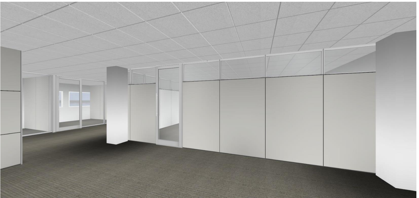
Entry and Conference Room

50% Deposit will be required to place the order.