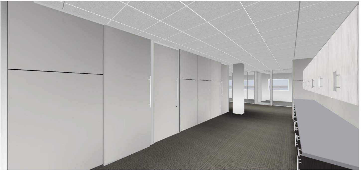
Restrooms and Supply