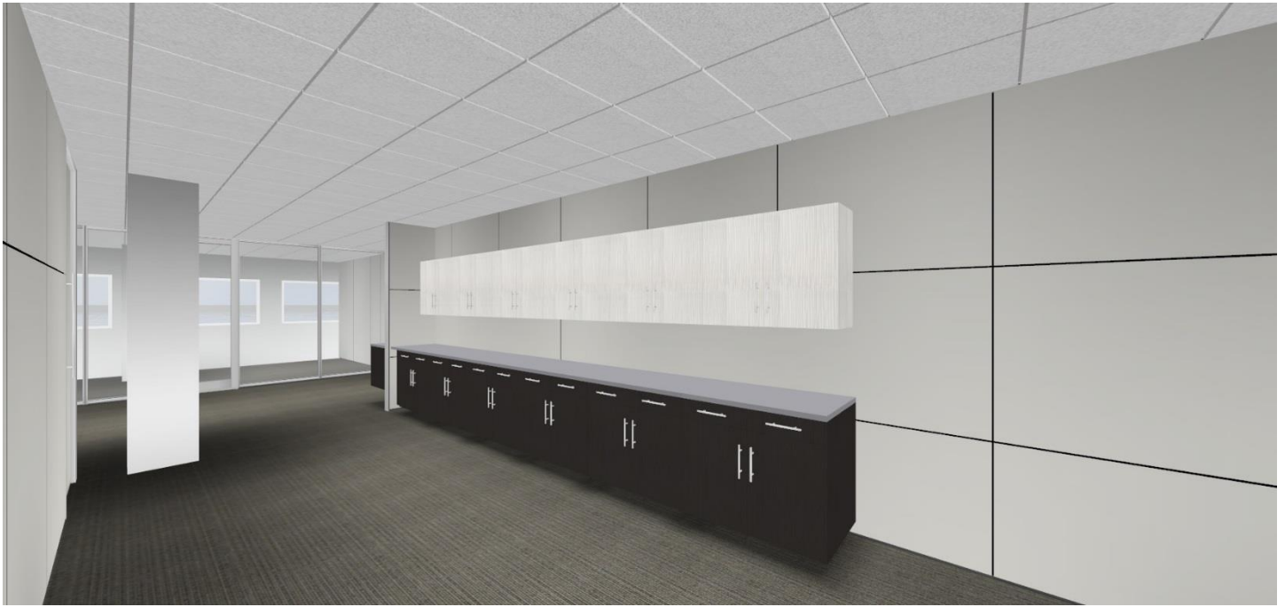
Copy and Storage Area