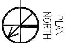
OPERATIONS BUILDING 2440 SECOND FLOOR REFLECTED CEILING PLAN SCALE: 1/8"=1'-0"