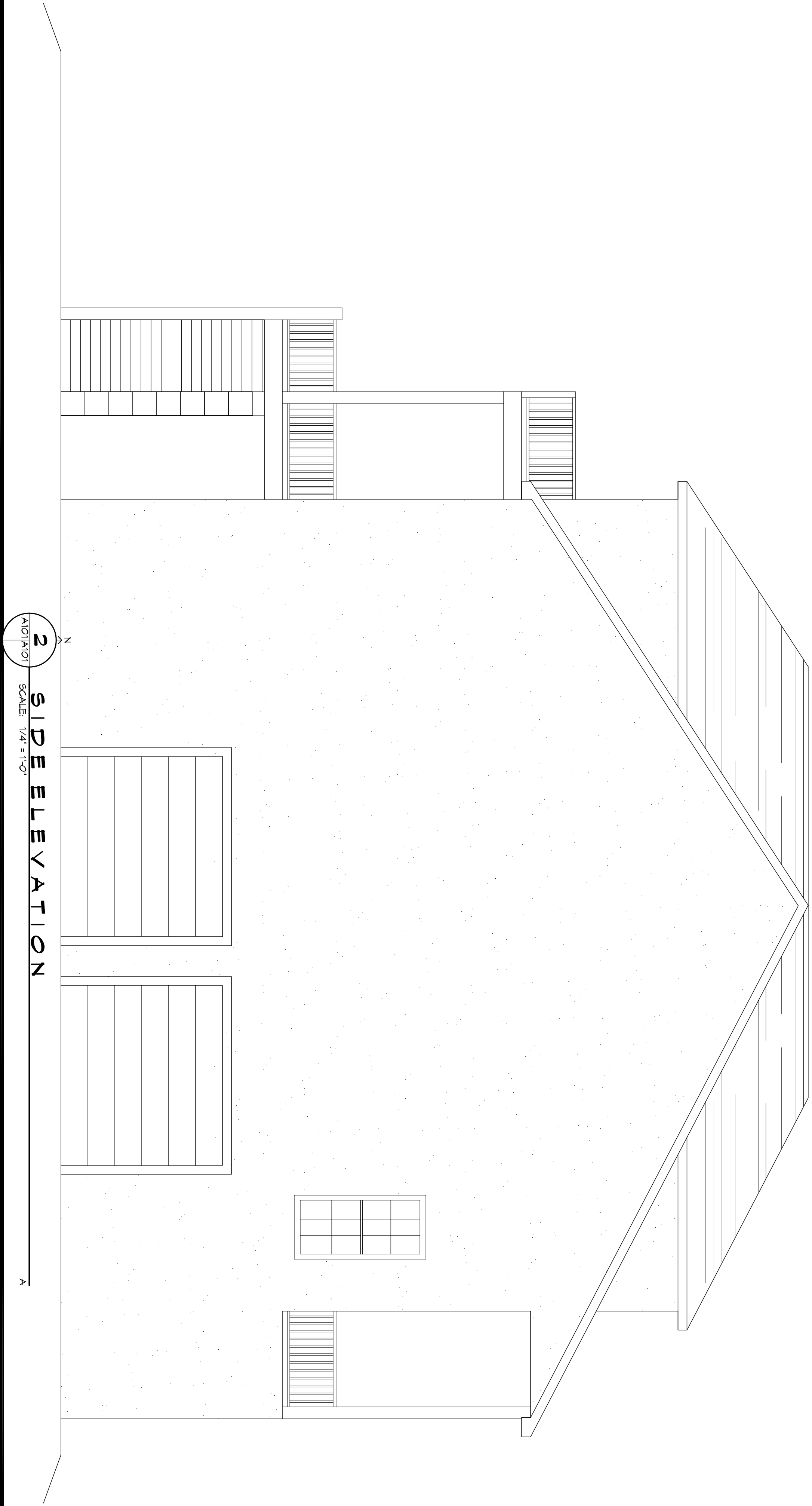
2 SIDE ELEVATION SCALE: 1/4" = 1'-0"