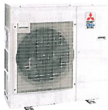
Outdoor Unit: PUZ-A24NHA6 (-BS)