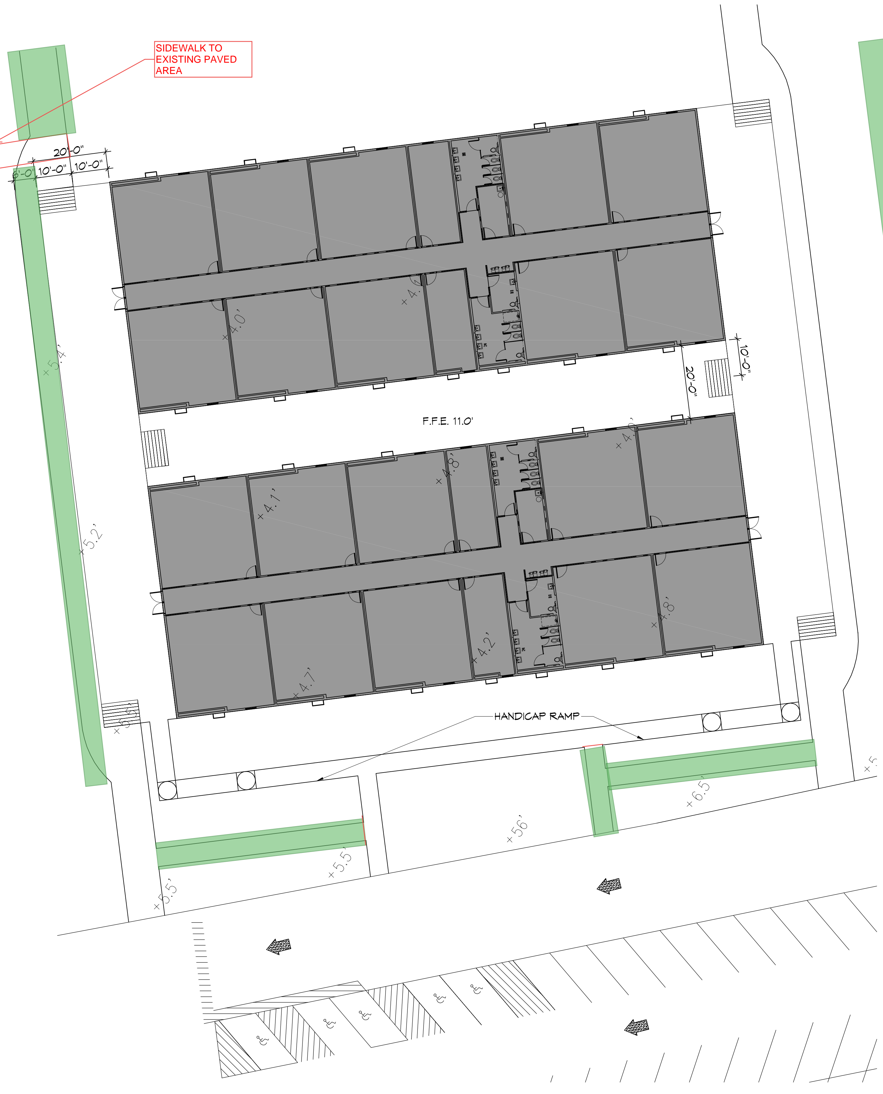
RAMP ON SIDE SCALE: 1/16"=1'-0"

D:\E\NAME - J.V. - Schemas\Private\3440 - Lakeside Christian Academy\Current\3440\A102.rvt Thursday, May 27, 2021 10:10 AM