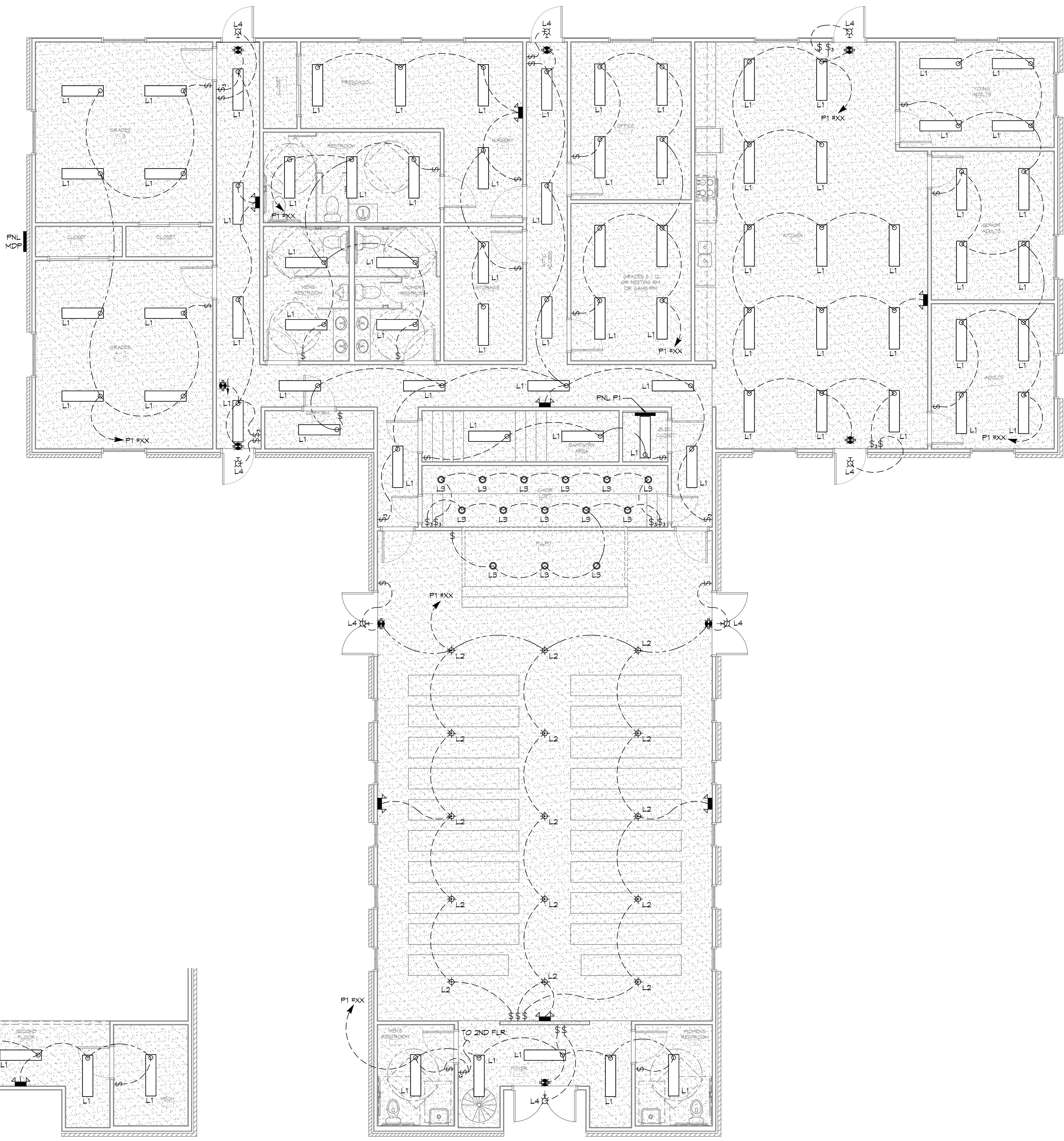
1 LEVEL 1 LIGHTING PLAN SCALE: 3/16"=1'-0"