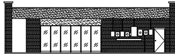
NEW NORTH SIDE ELEVATION