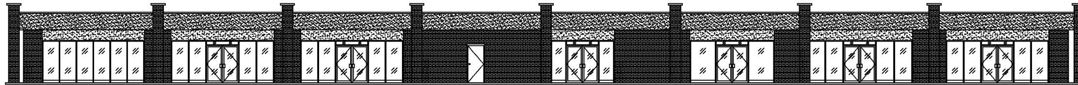
NEW EAST FRONT ELEVATION