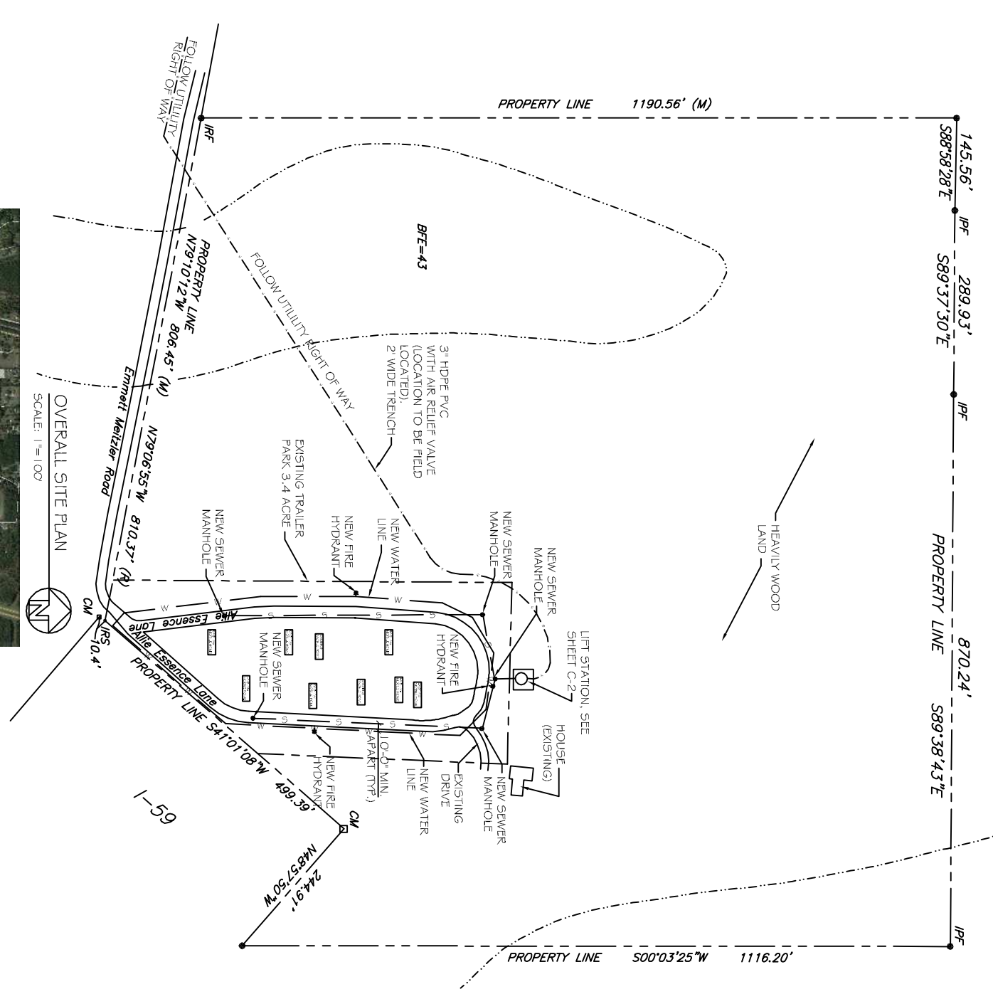
OVERALL SITE PLAN SCALE: 1"=100'