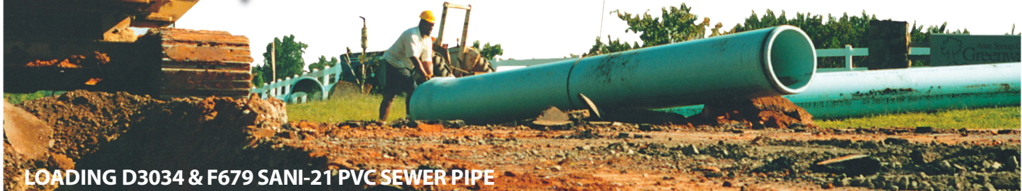
LOADING D3034 & F679 SANI-21 PVC SEWER PIPE