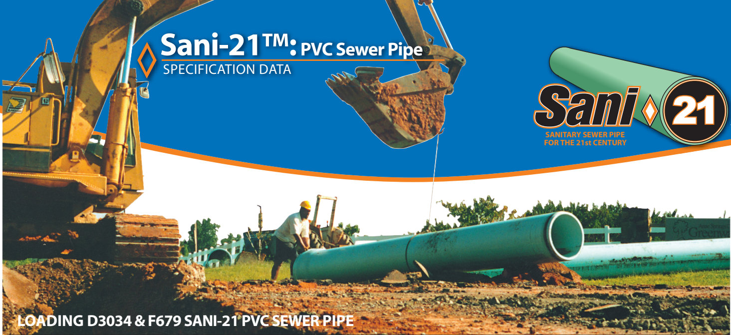
LOADING D3034 & F679 SANI-21 PVC SEWER PIPE