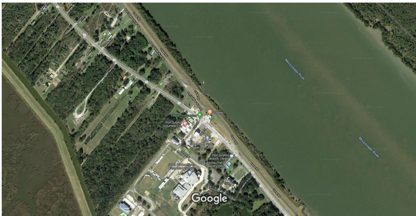
200 ft