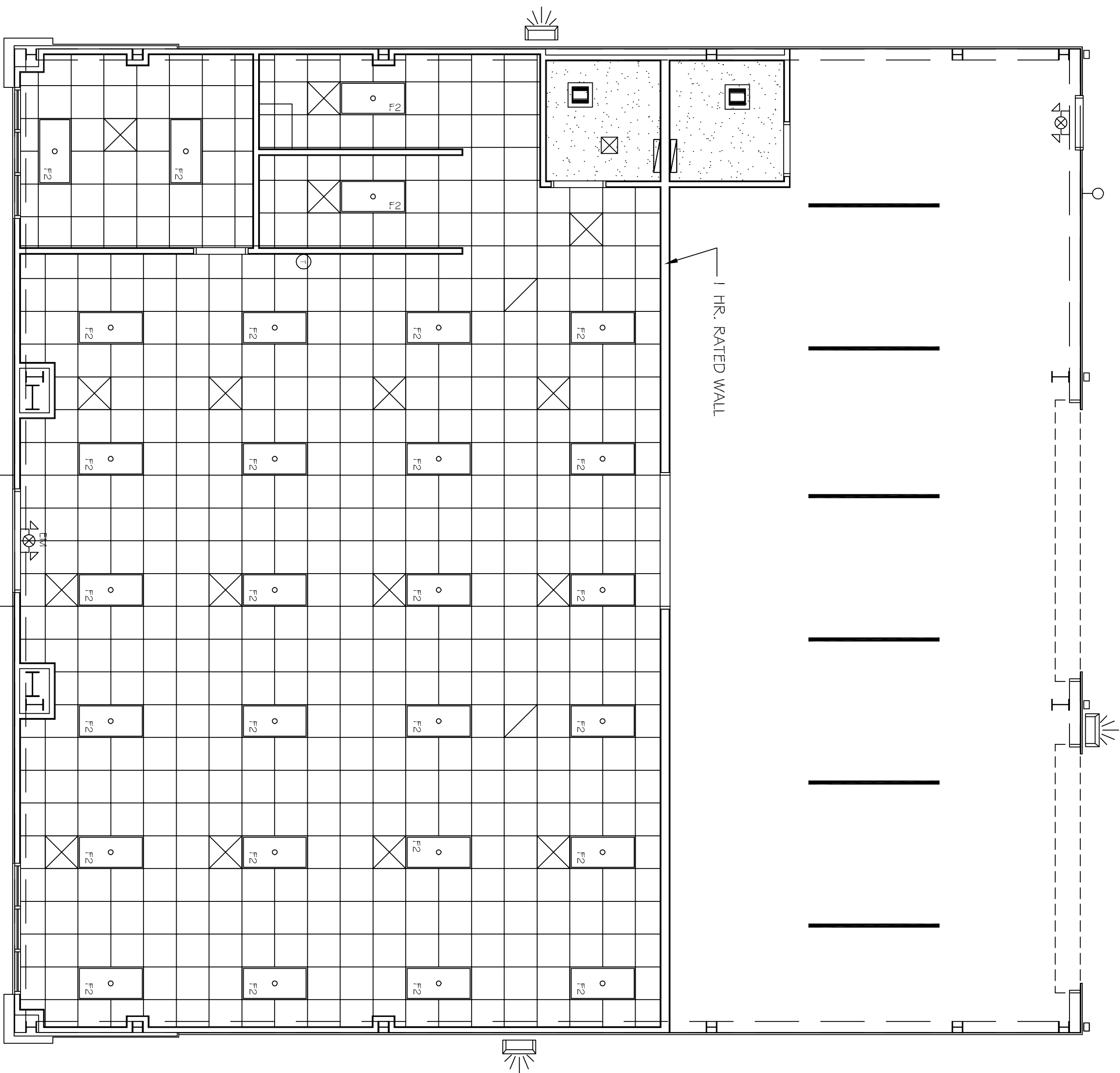
REFLECTED CEILING PLAN SCALE: 3/16" = 1'