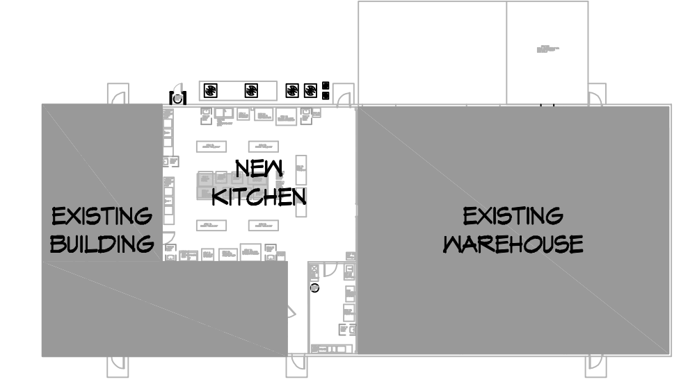
KEY PLAN SCALE: 1/32"=1'-0"