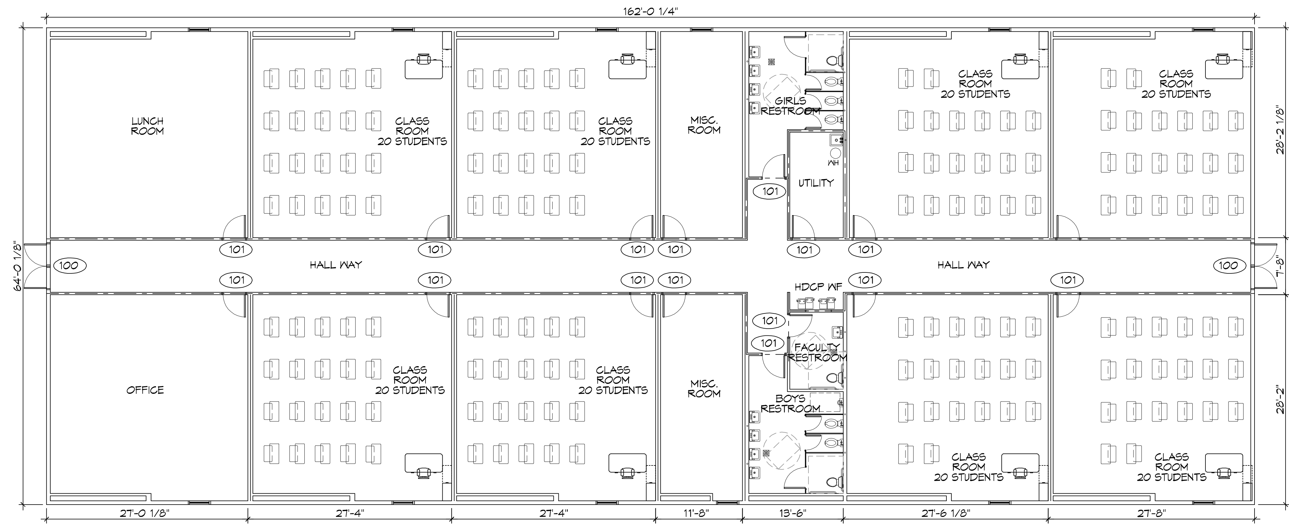
19 BUILDING "A" EXISTING FLOOR PLAN SCALE: 1/8"=1'-0"

FILE NAME: J:\19_School_Renov\19-040 - Lelande Christian Academy\19-040 - Floor Plans.dwg PLOT DATE: 8/15/2021 11:30:39 AM