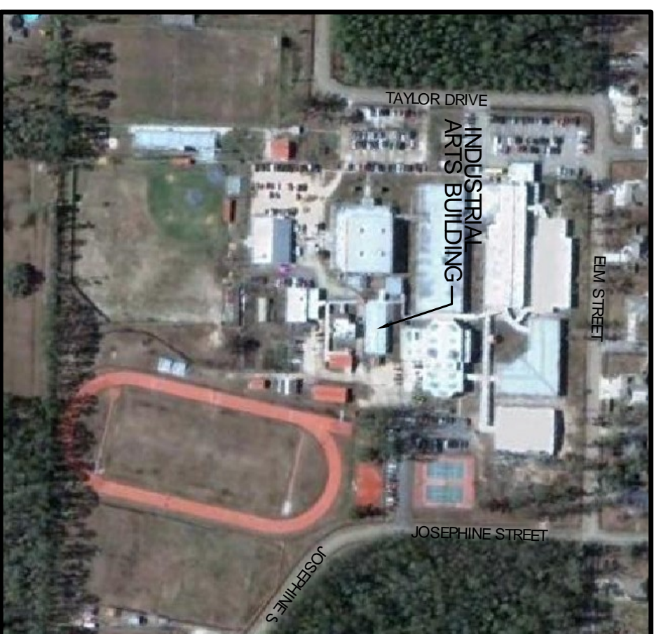
SITE PLAN N.T.S.