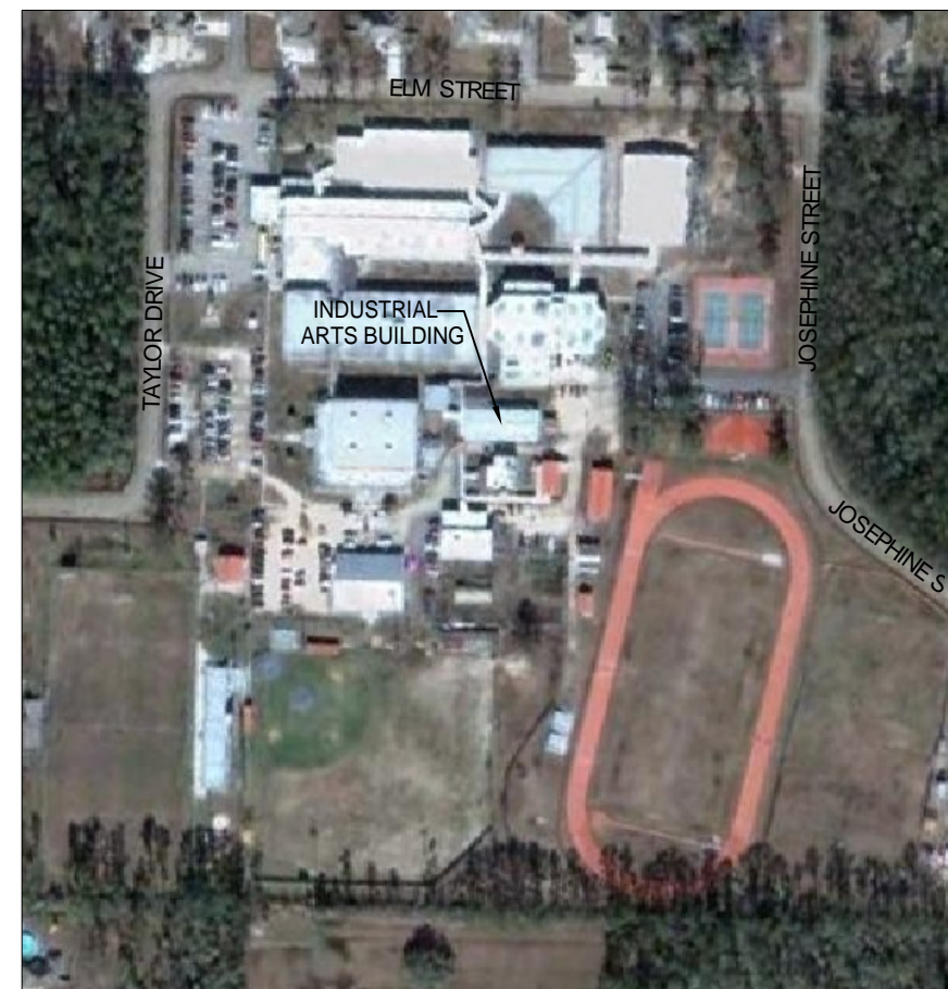
SITE PLAN N.T.S.