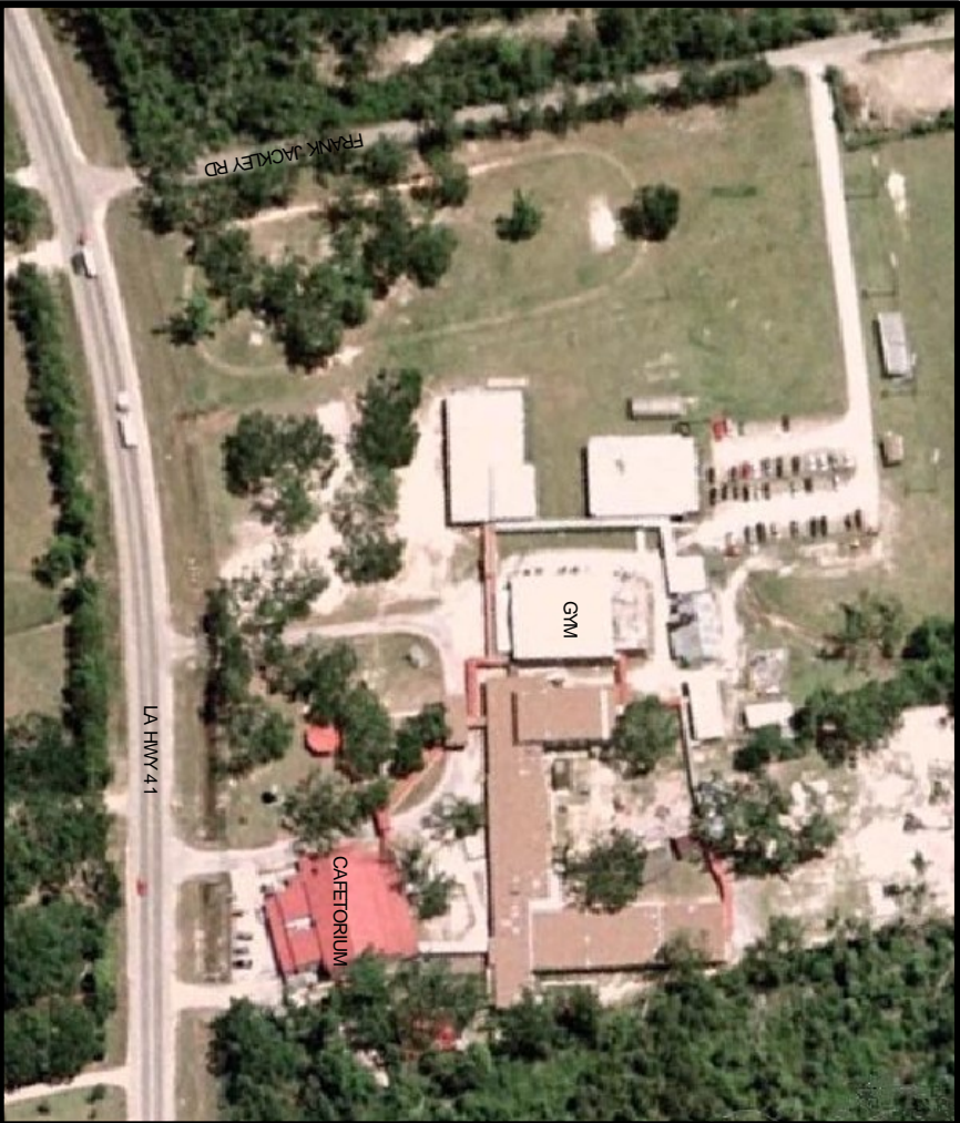
SITE PLAN N.T.S.