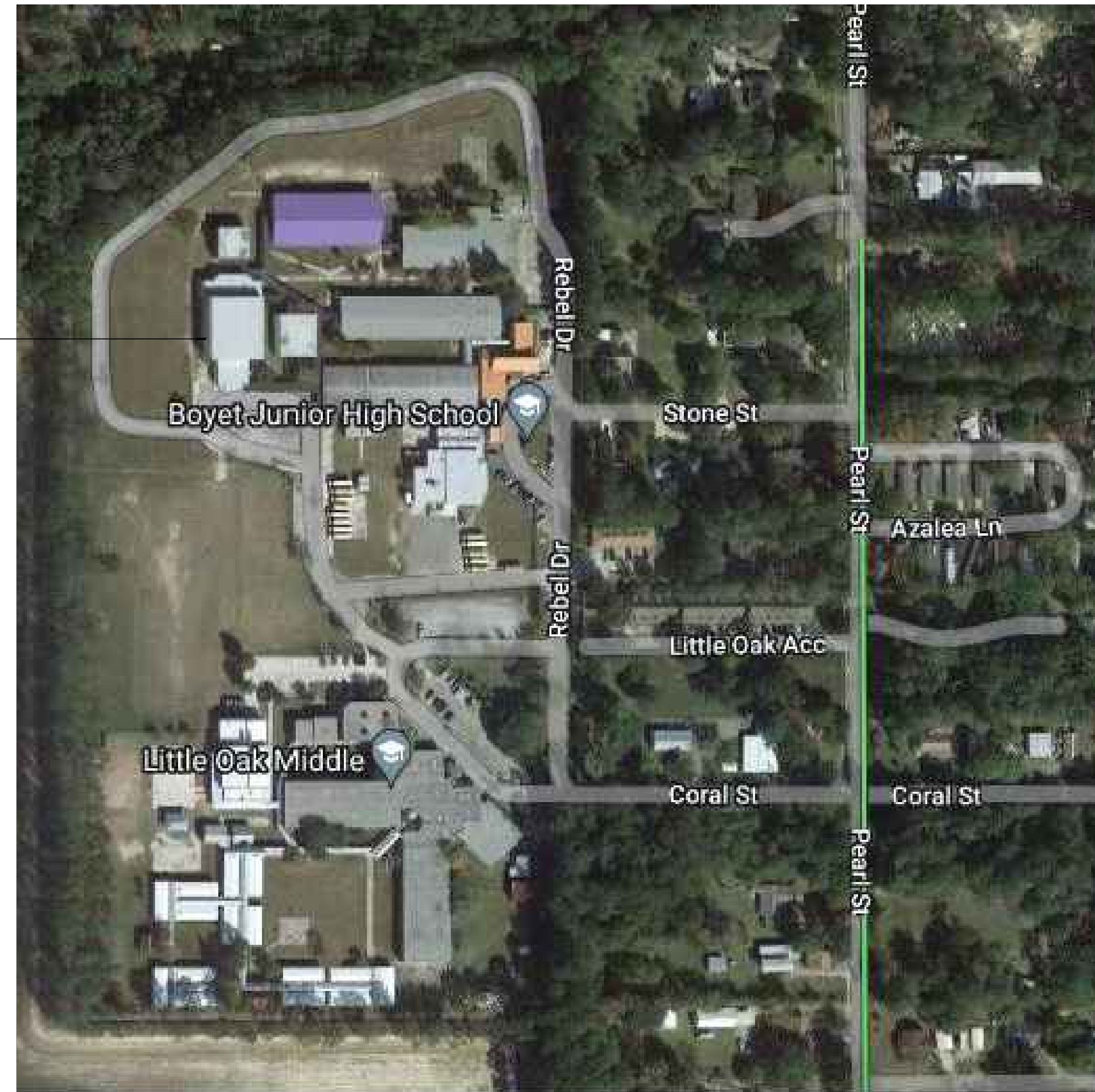
SITE PLAN SCALE: 1" = 100'-0"