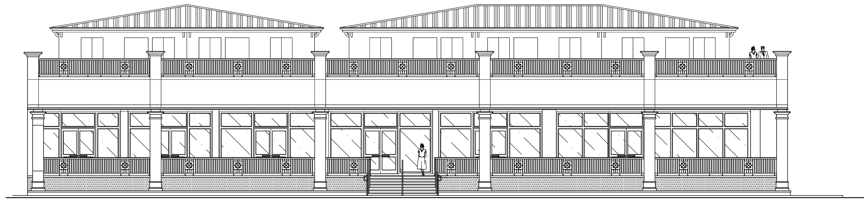
NEW FRONT ELEVATION - TULANE BLVD VIEW