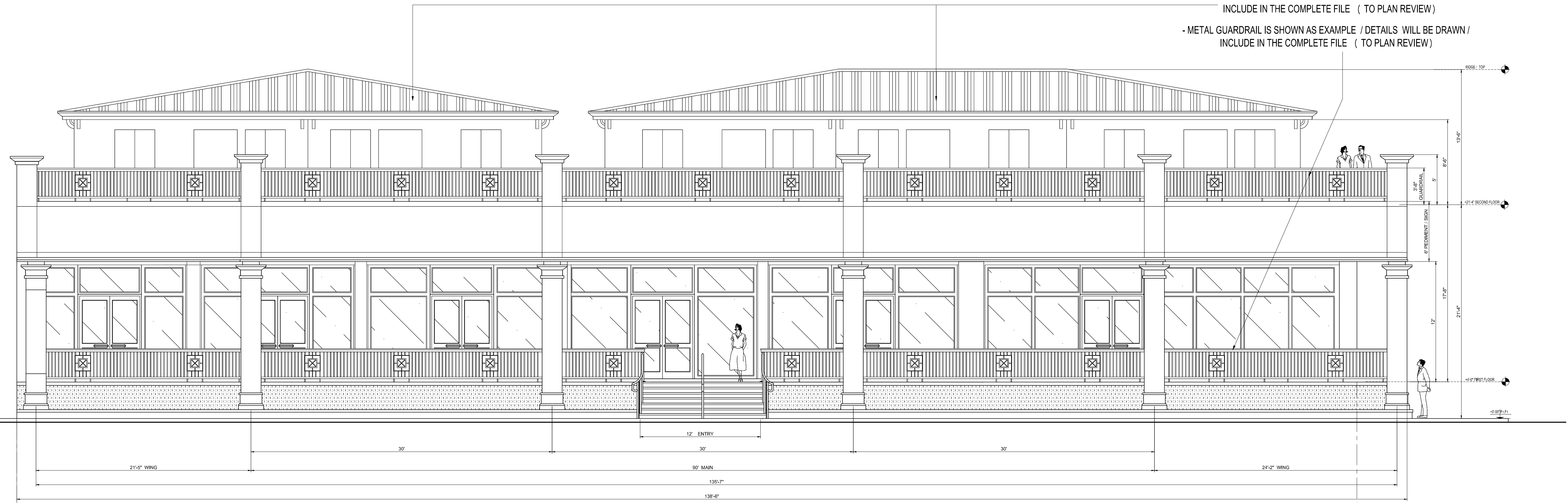
FRONT ELEVATION - TULANE BLVD VIEW SCALE : 3/16" = 1'-0" - ALL : STUCCO COVERED ( COLUMN, PEDIMENT, SIDE WALL, COPING... ) - STOREFRONT : COMB. ENTRY DOOR W/ GLASS PANEL - MTL FRAME

- HOUSES ELEVATION IS SHOWN AS FORMED / DETAILS WILL BE DESIGN / INCLUDE IN THE COMPLETE FILE ( TO PLAN REVIEW ) - METAL GUARDRAIL IS SHOWN AS EXAMPLE / DETAILS WILL BE DRAWN / INCLUDE IN THE COMPLETE FILE ( TO PLAN REVIEW )