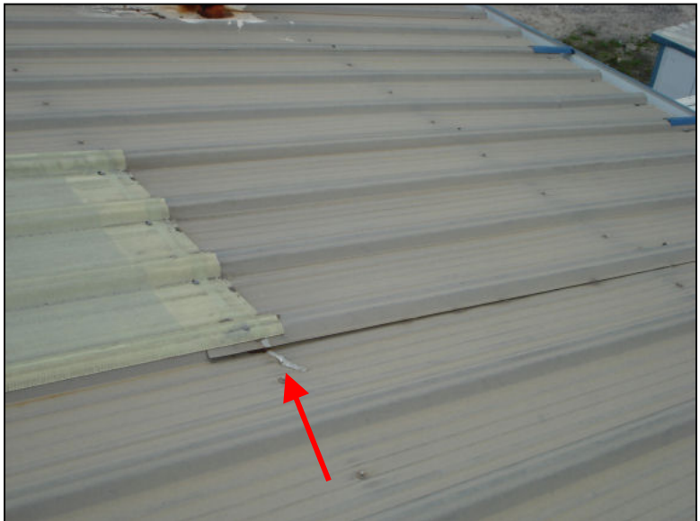
13. Rake trim missing.