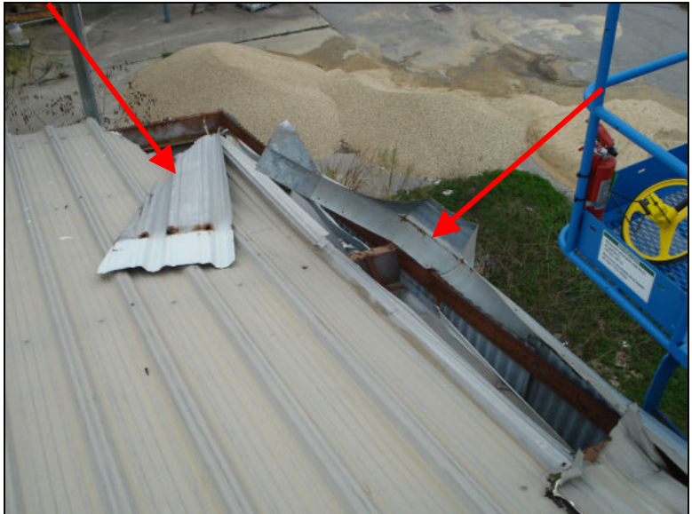
15. Missing and detached vents also damaged side panels.