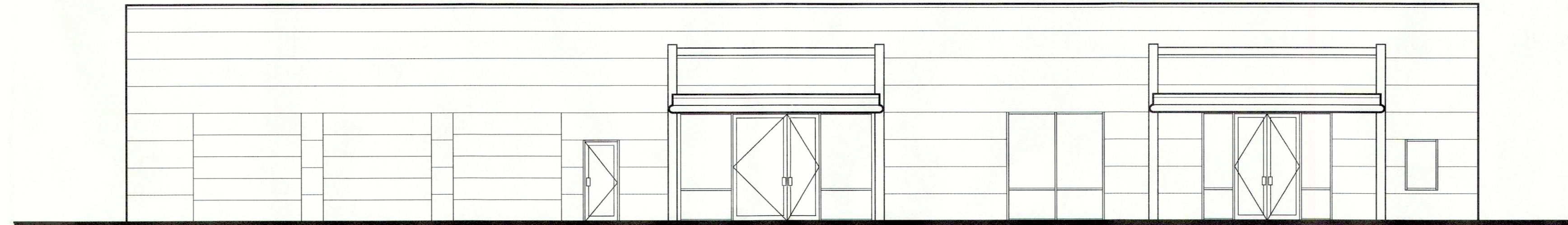
EXISTING SOUTHWEST VIEW (FRONT) SCALE: 1/8" = 1'-0"