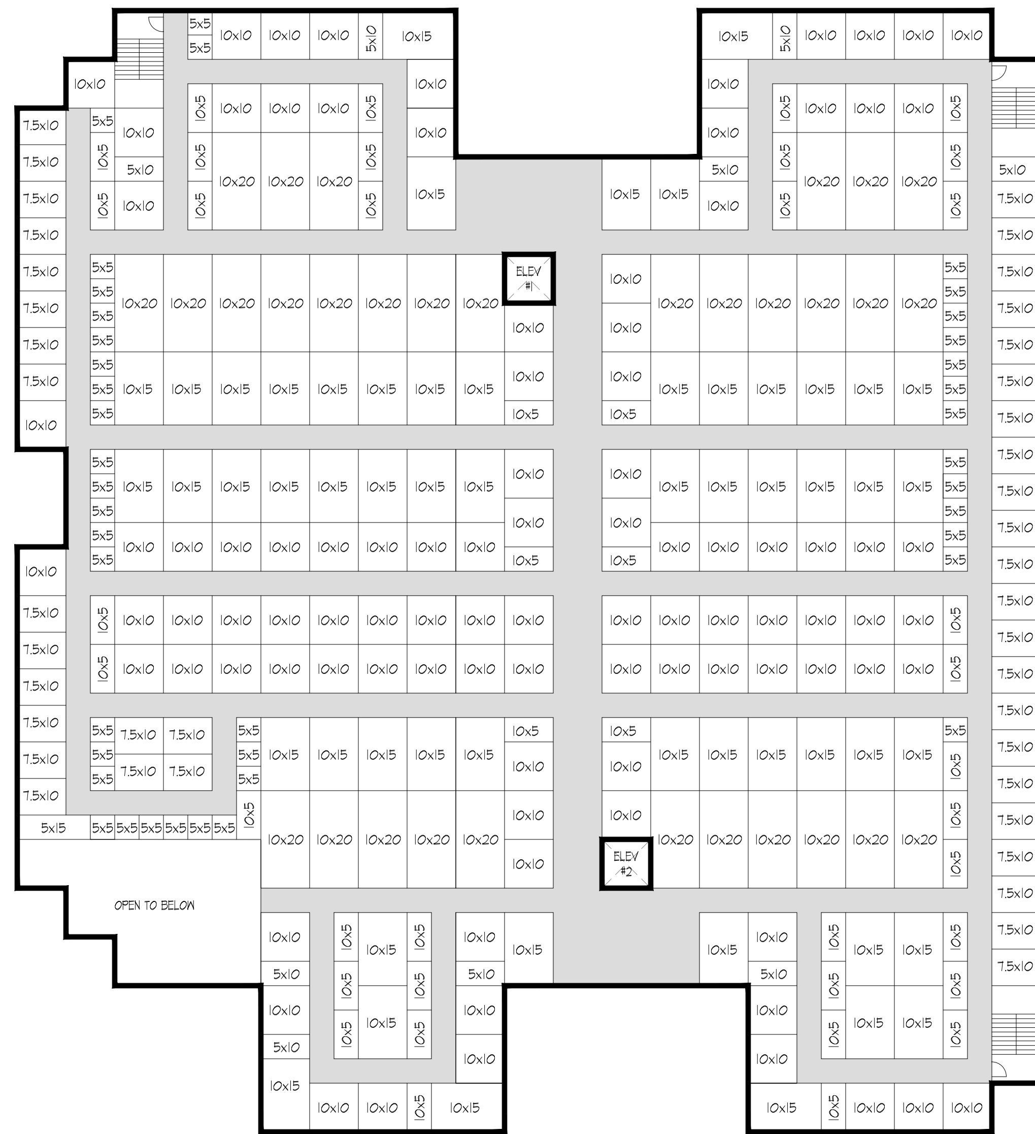
2nd FLOOR UNITMIX