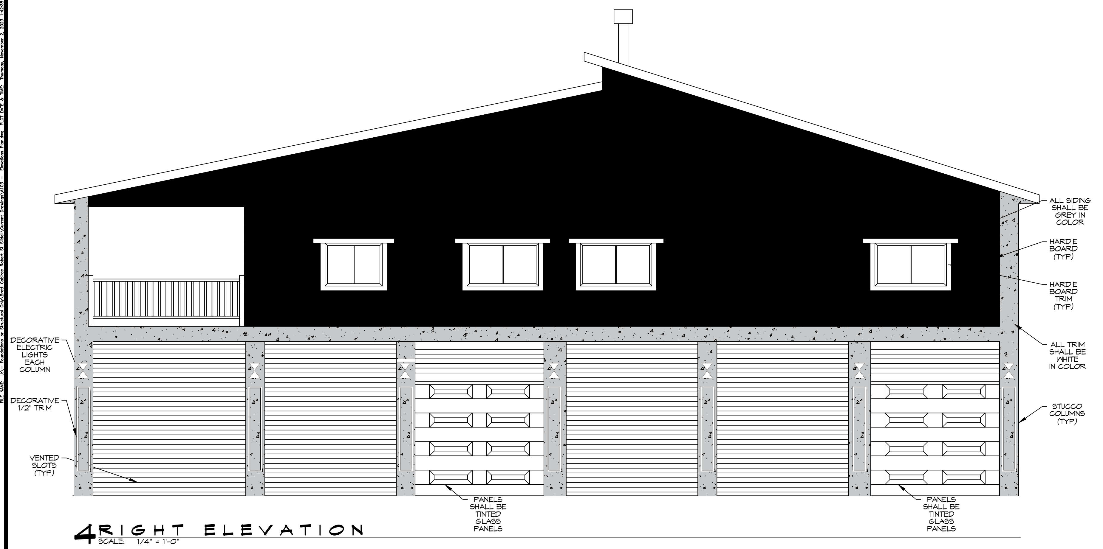
4 RIGHT ELEVATION SCALE: 1/4" = 1'-0"

SEE SHEET A-1 FOR FOUNDATION & STRUCTURE. CONSULT ARCHITECT FOR ALL DIMENSIONS. DATE: 07-24-2023. PROJECT: BAYOU BOULEVARD, SLIDELL, LA.