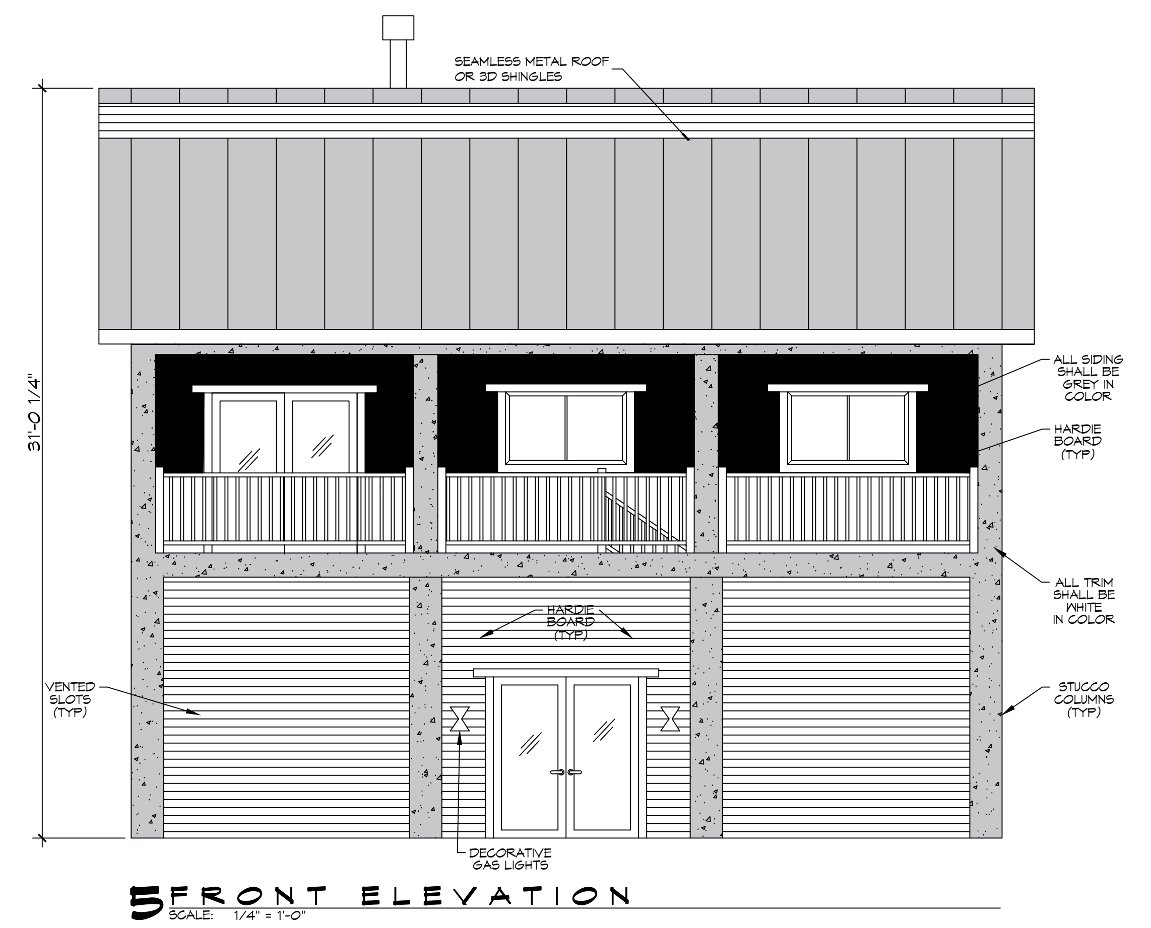
5 FRONT ELEVATION SCALE: 1/4" = 1'-0"