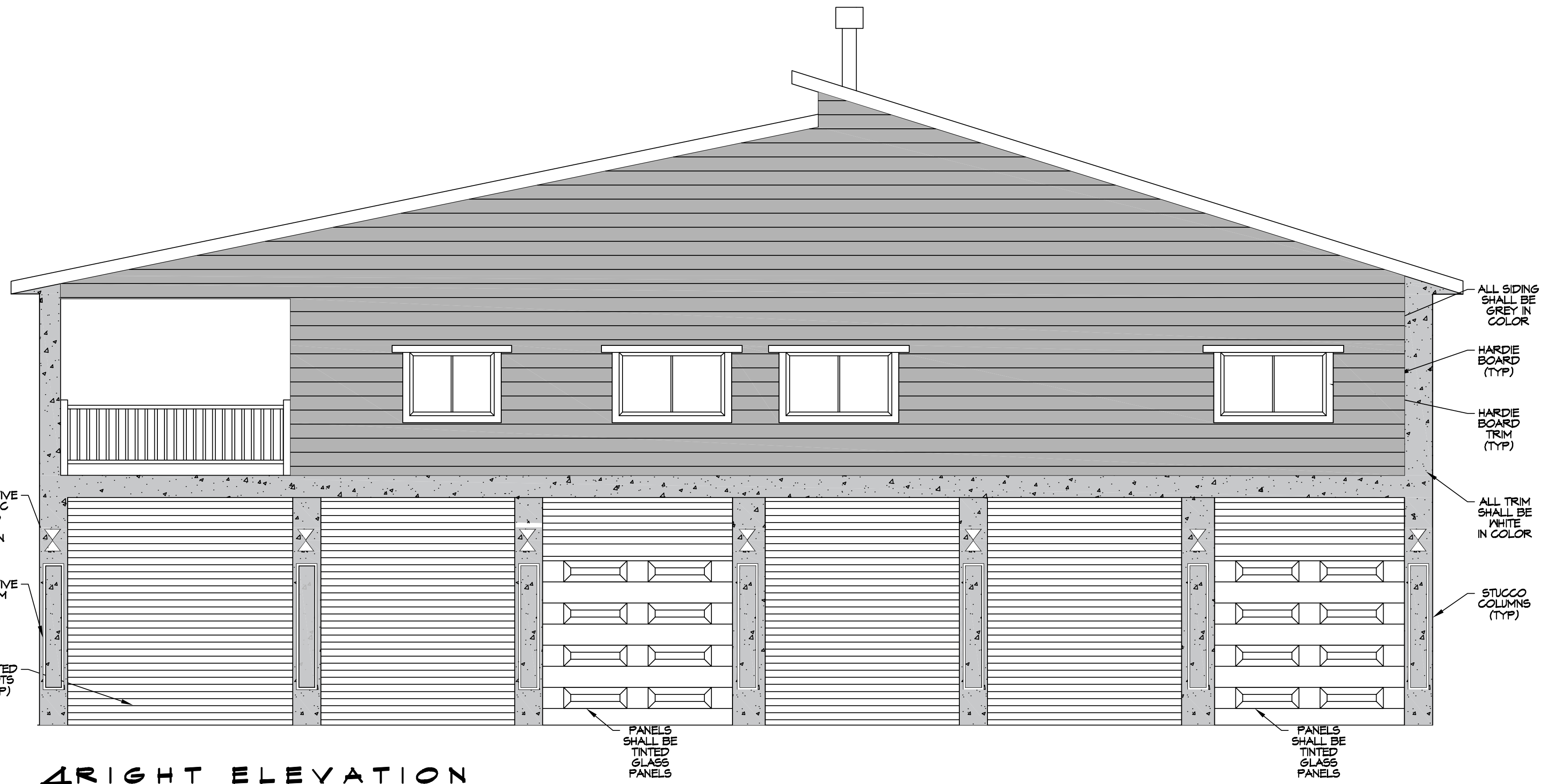
4 RIGHT ELEVATION SCALE: 1/4" = 1'-0"

SEE PAGE 11 - FOUNDATION OF STRUCTURE (CONCRETE) SHEET 10 - 5/24/2023 (REVISED) DRAWING NO. A103 - EXISTING STRUCTURE - 01/24/2023 - NUMBER NUMBER 1, 2023 - 10/2023