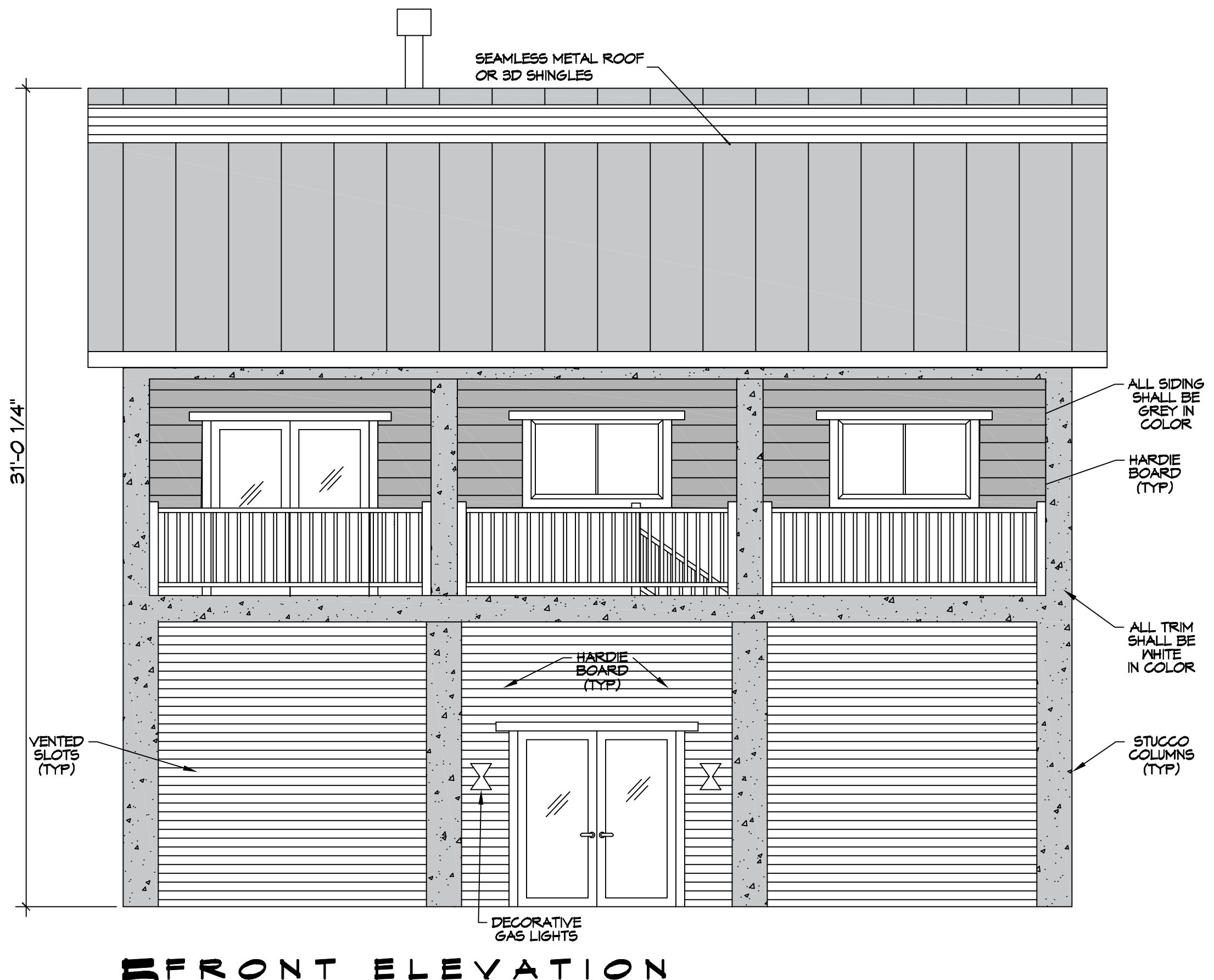
5 FRONT ELEVATION SCALE: 1/4" = 1'-0"