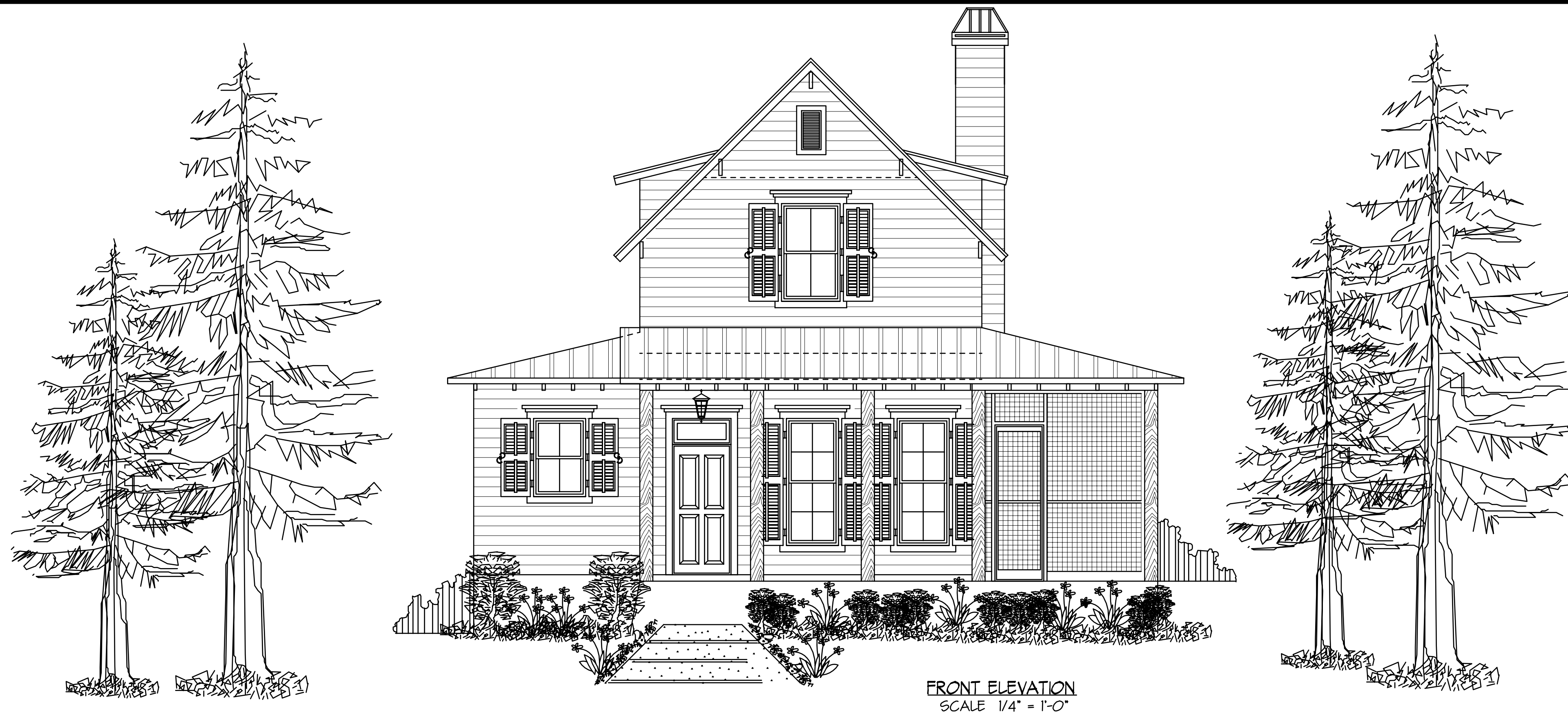
FRONT ELEVATION SCALE 1/4" = 1'-0"