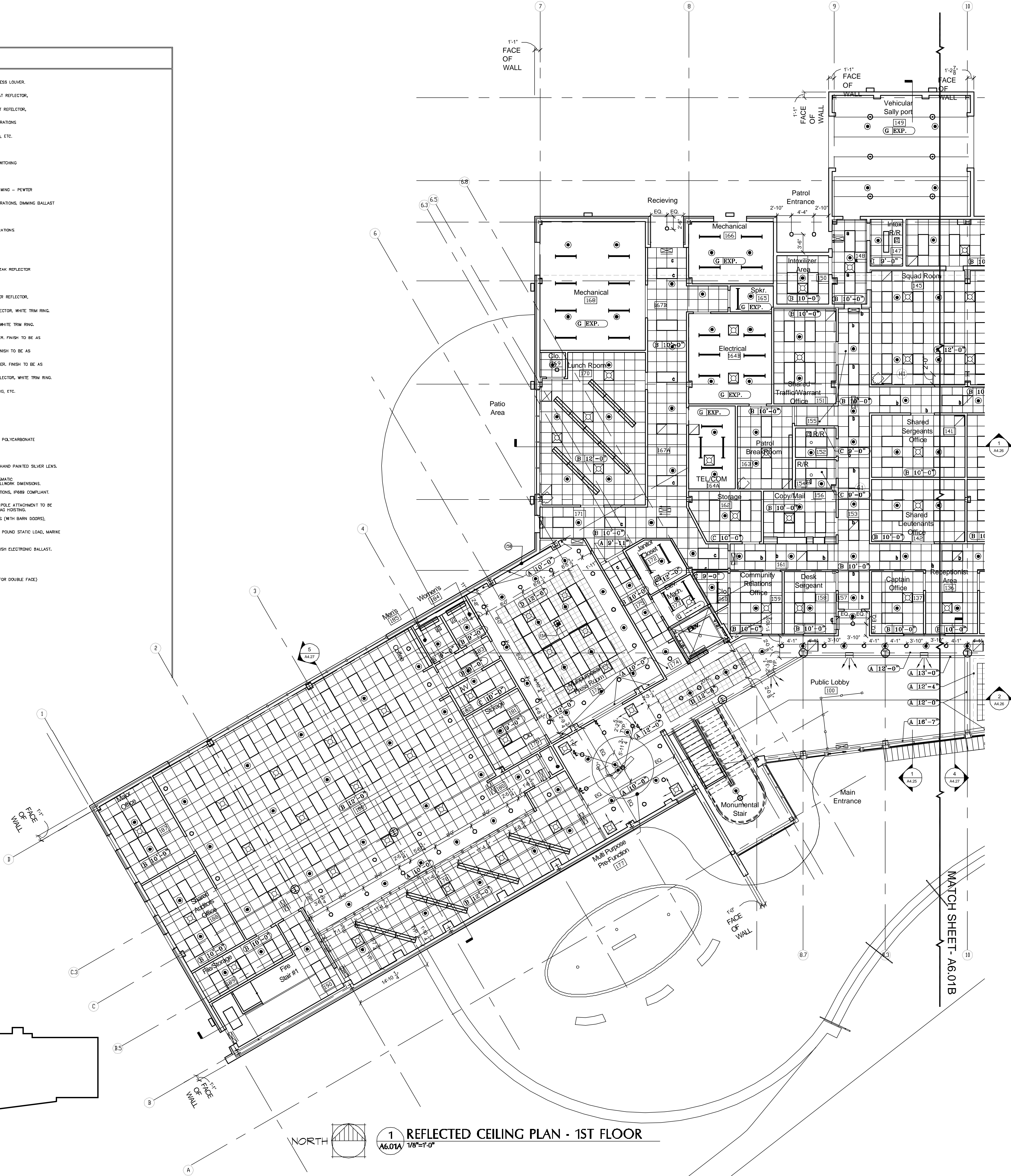
1 REFLECTED CEILING PLAN - 1ST FLOOR A6.01A 1/8"=1'-0"