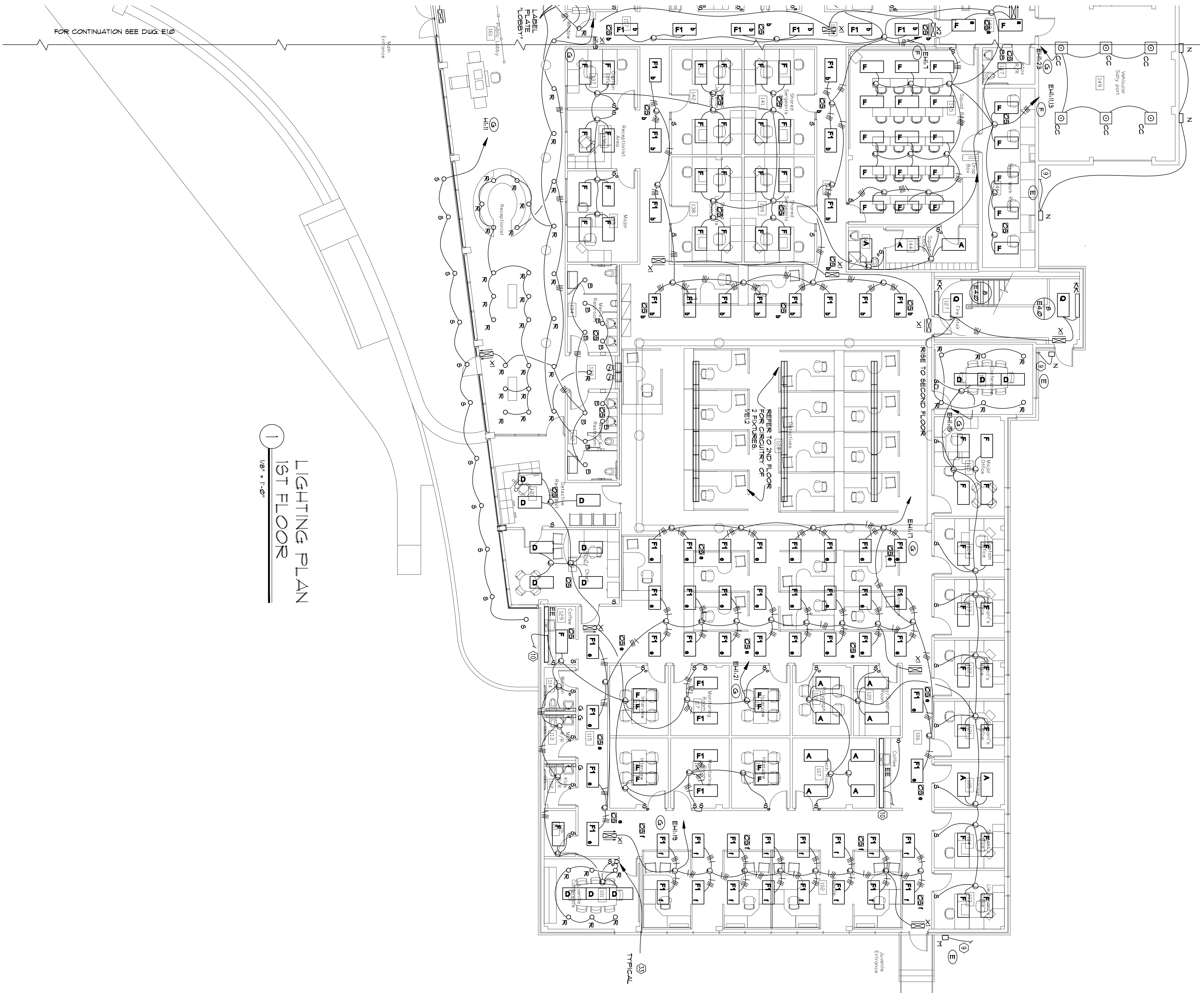
1 1/8" = 1'-0" LIGHTING PLAN 1ST FLOOR