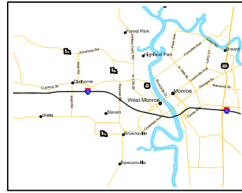
VICINITY MAP (Not to Scale)