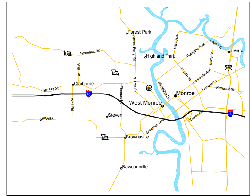
VICINITY MAP (Not to Scale)