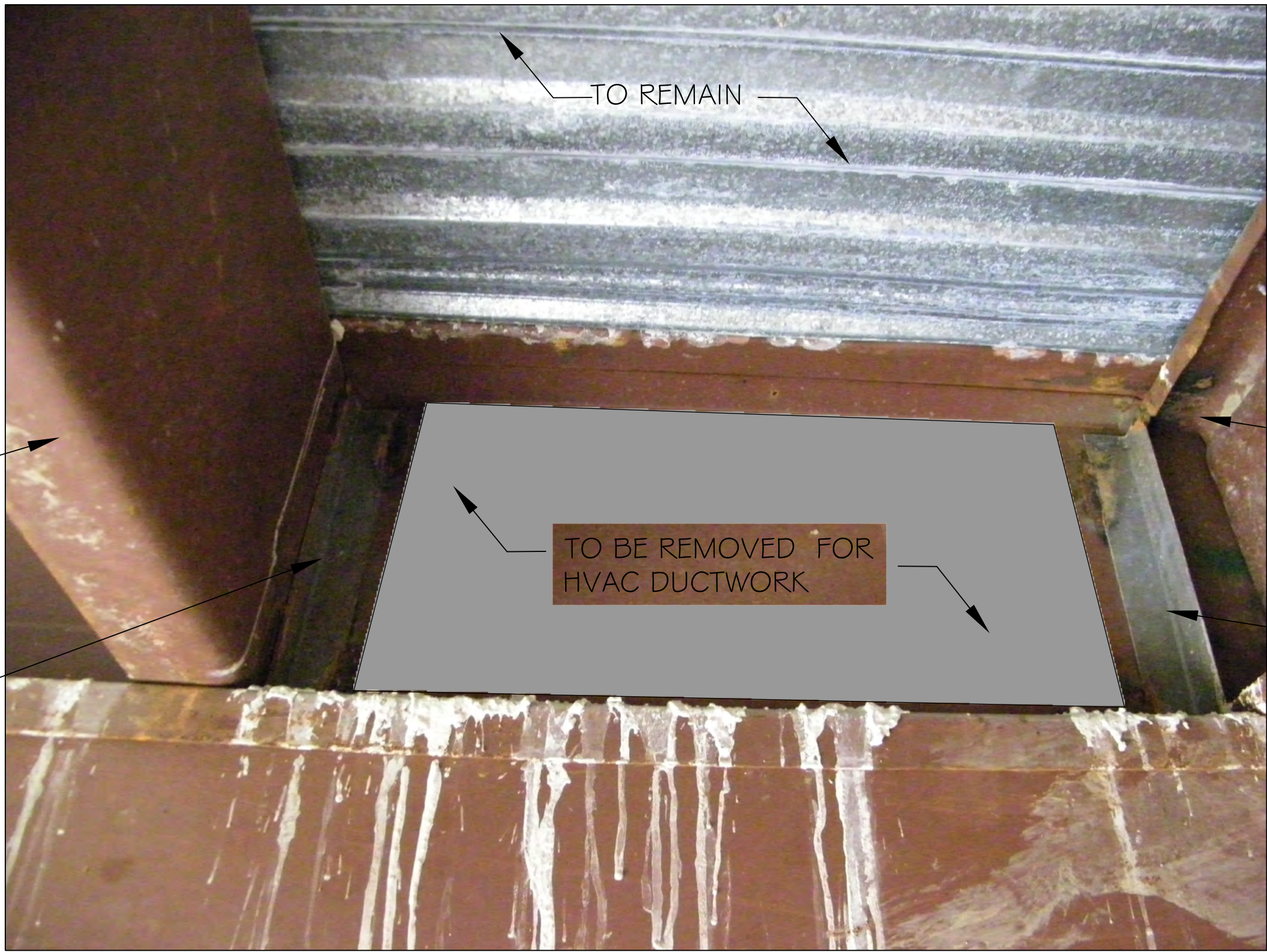
DEMO DETAIL N.T.S.