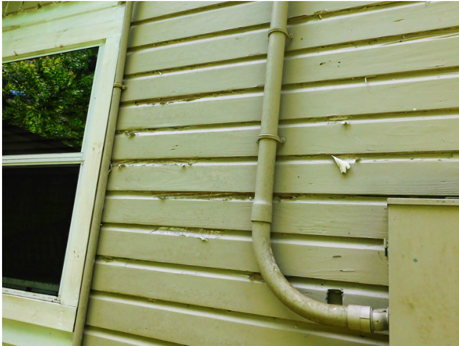
Hazard - Back