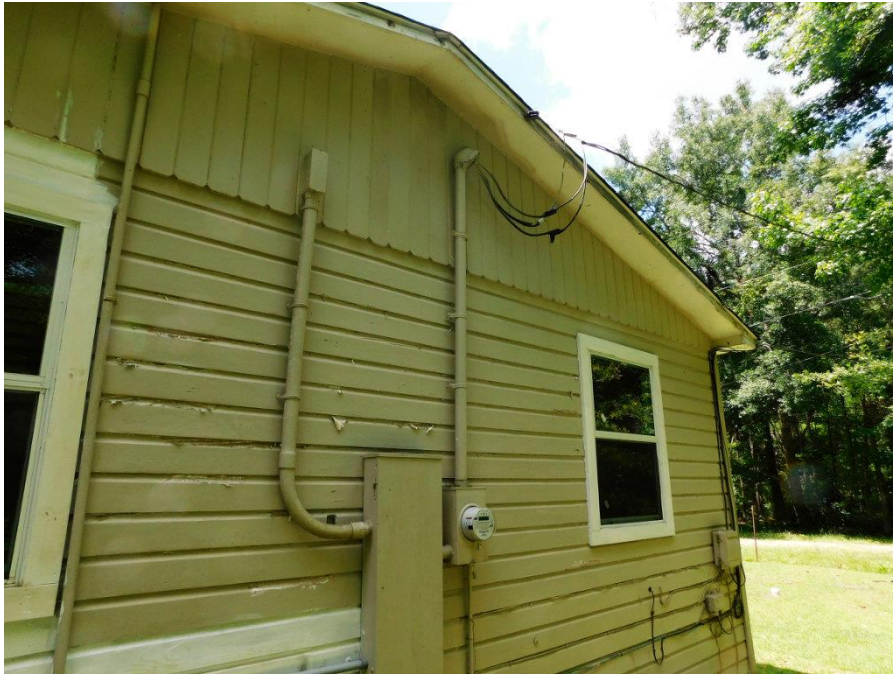
Electric Meter / Mast