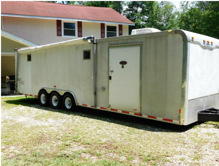
Other - Exterior