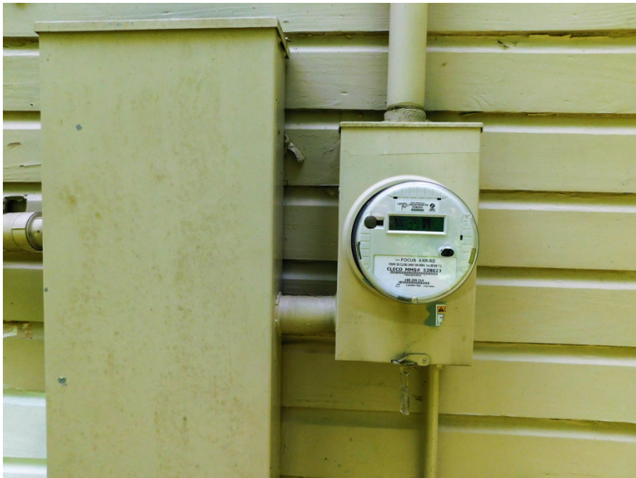
Electric Meter / Mast