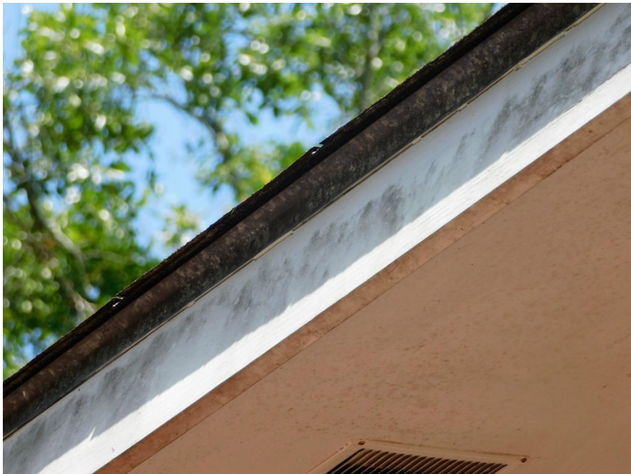
Hazard - Front