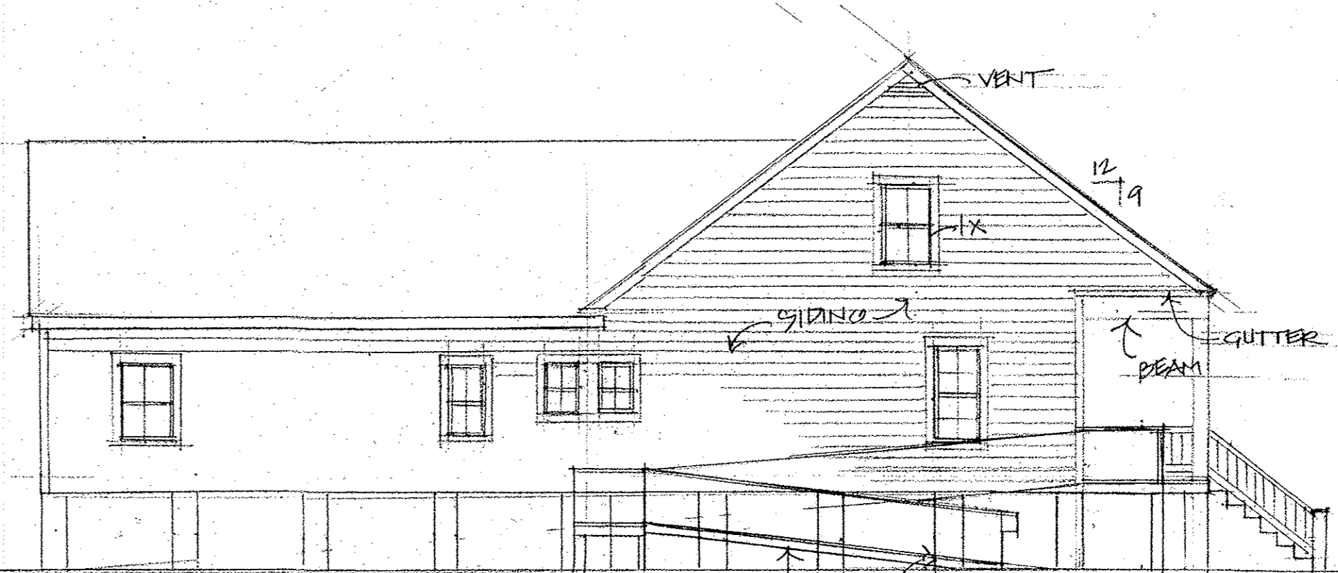
LEFT SIDE 1/8"