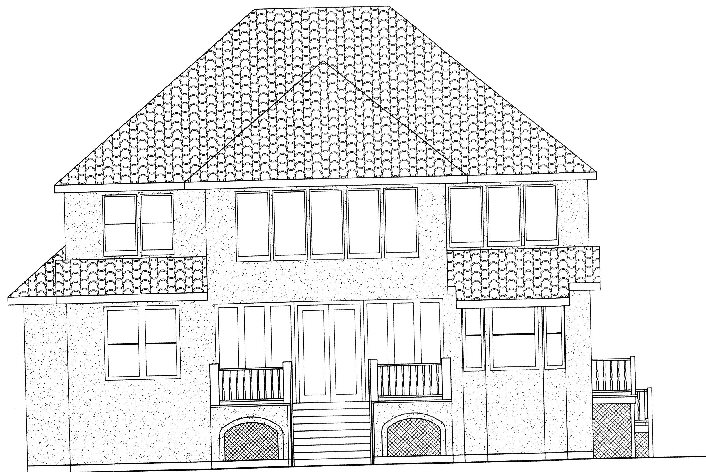
2 EXISTING REAR ELEVATION A201 SCALE: 3/16" = 1'-0"