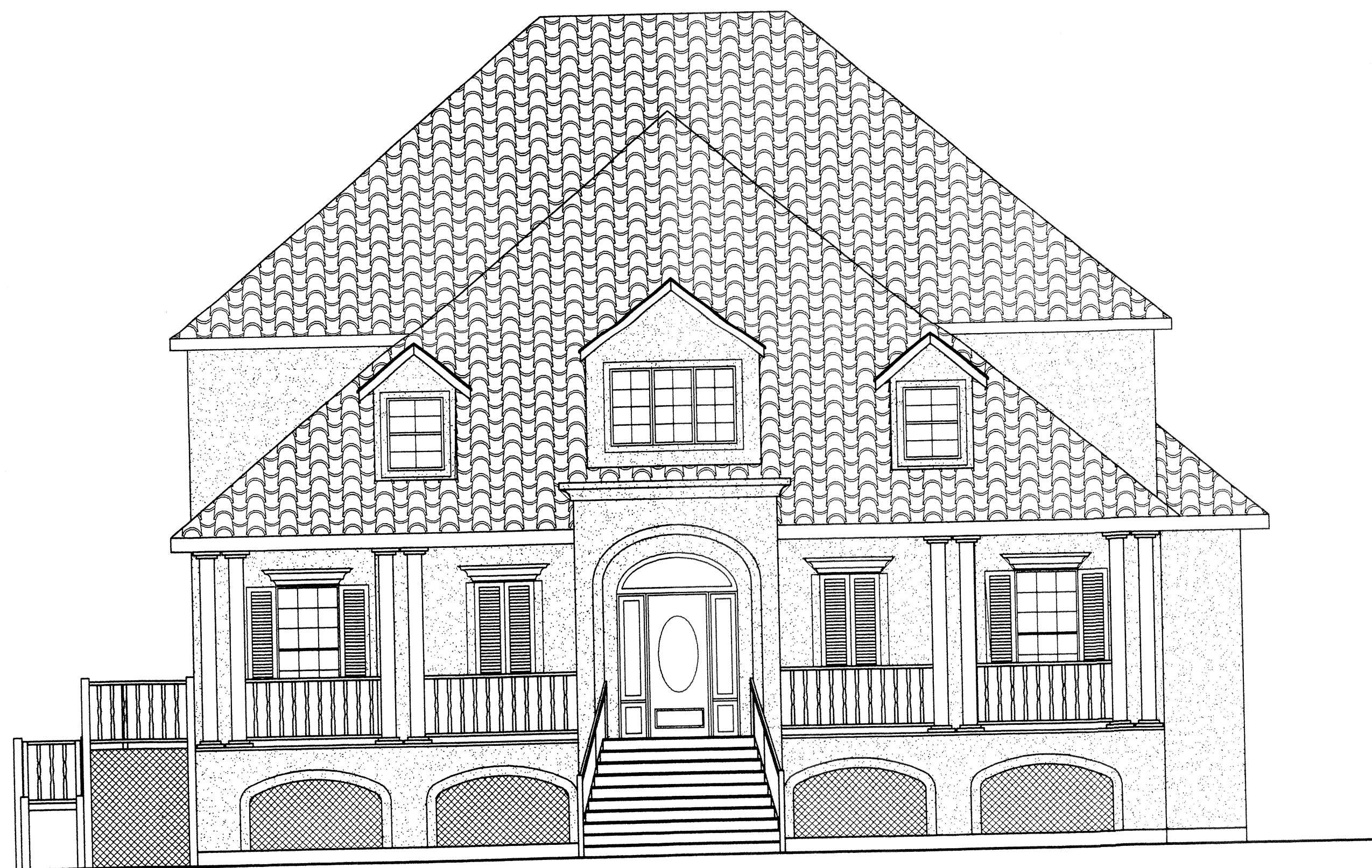
1 EXISTING FRONT ELEVATION A201 SCALE: 3/16" = 1'-0"