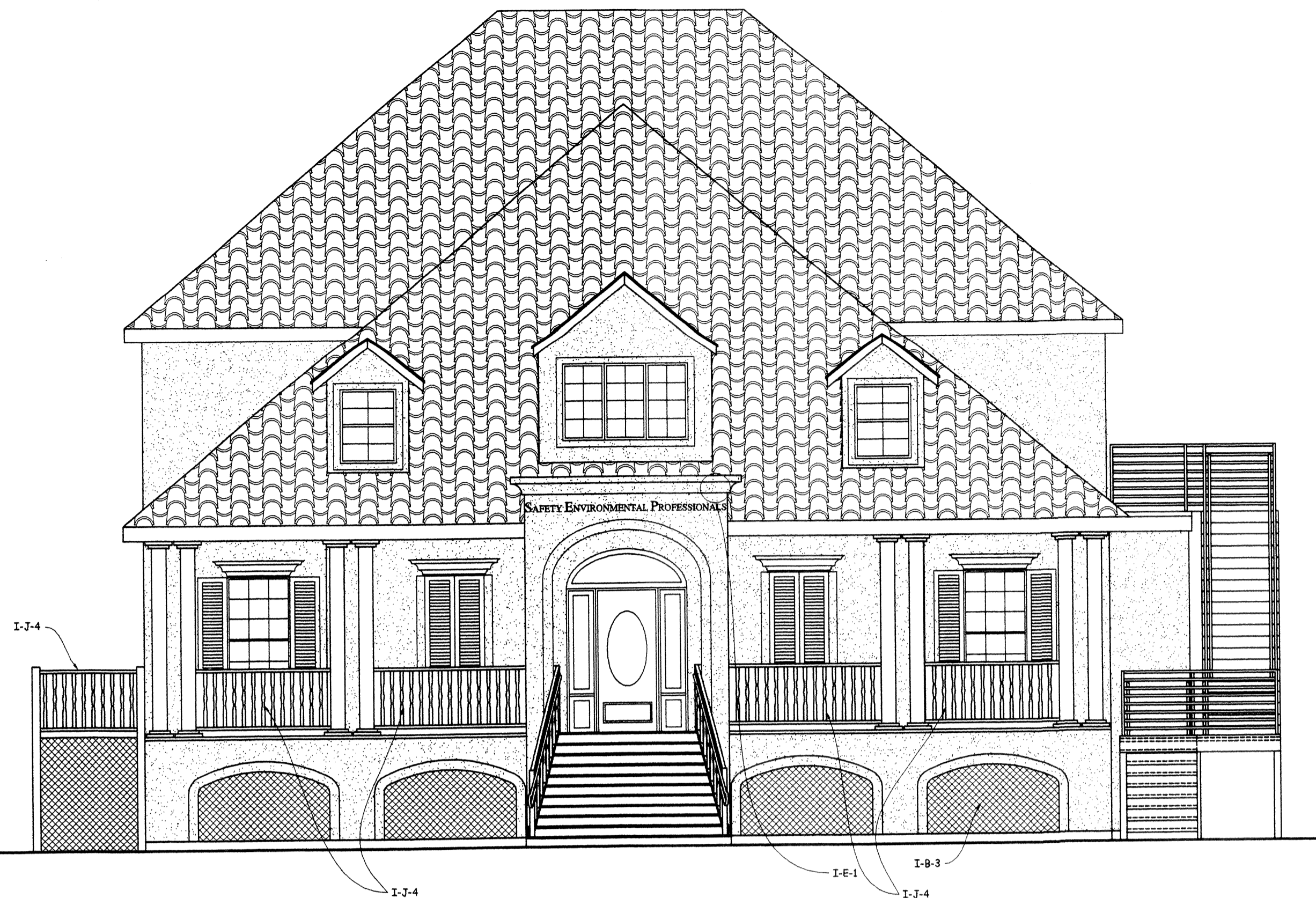
1 PROPOSED FRONT ELEVATION A202 SCALE: 3/16" = 1'-0"