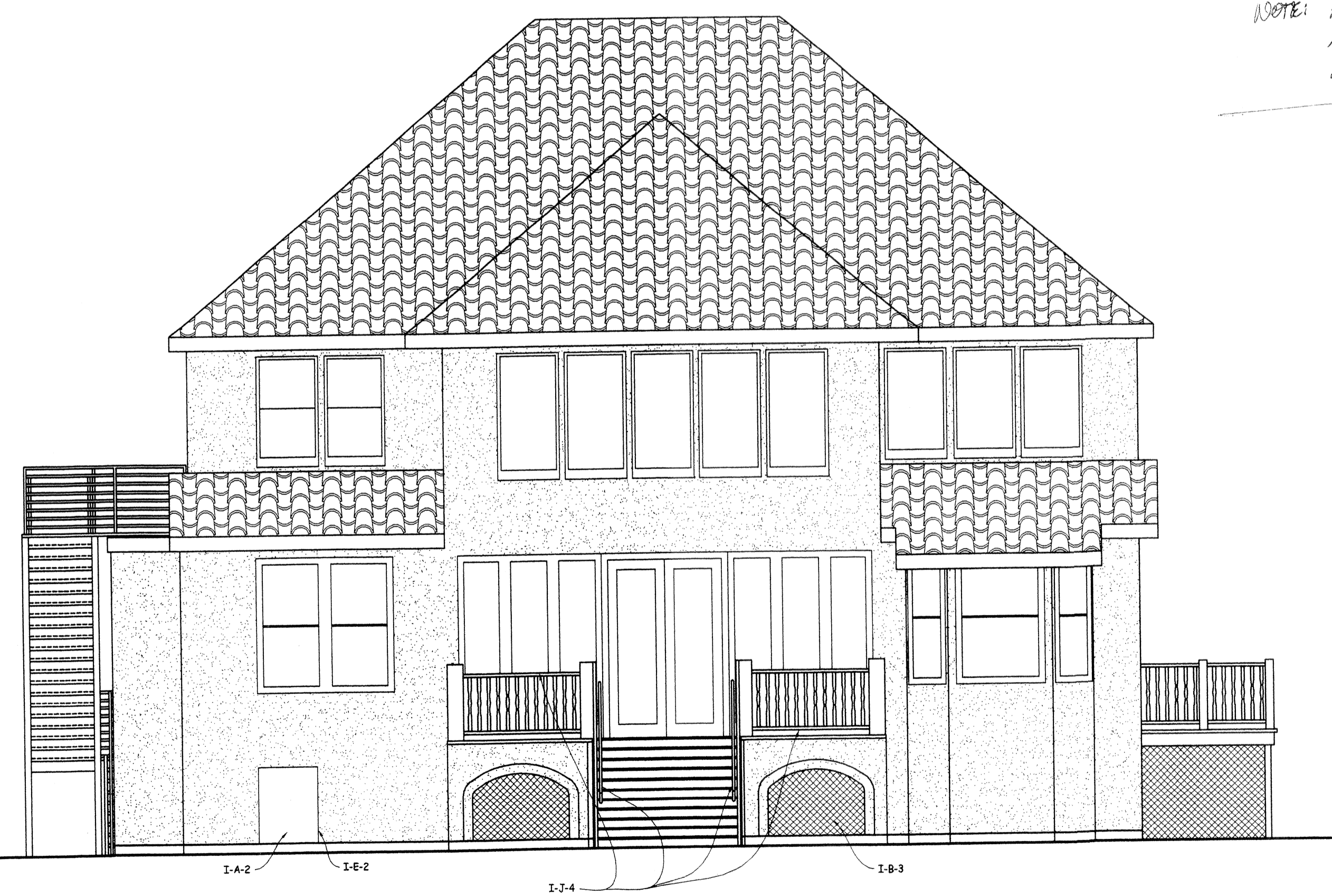
3 PROPOSED REAR ELEVATION A202 SCALE: 3/16" = 1'-0"

NOTE: All guard rails & spindles to be reconstructed in a manner which prevents the passage of a sphere of 4" o.d.