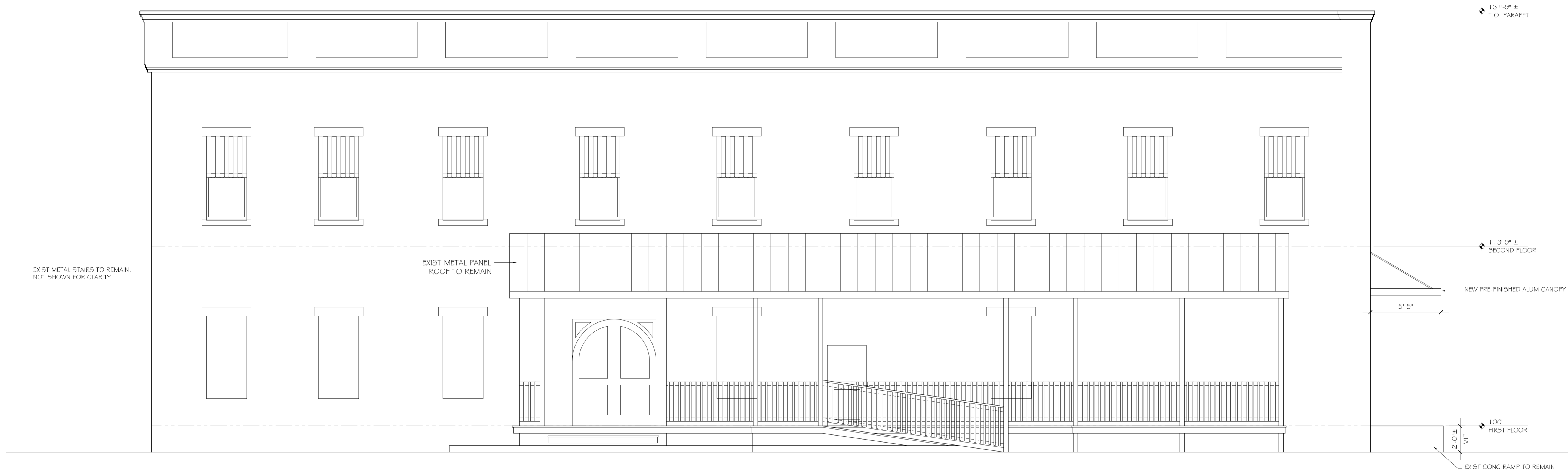
2 EXTERIOR ELEVATION - NORTH SCALE: 1/4" = 1'-0"