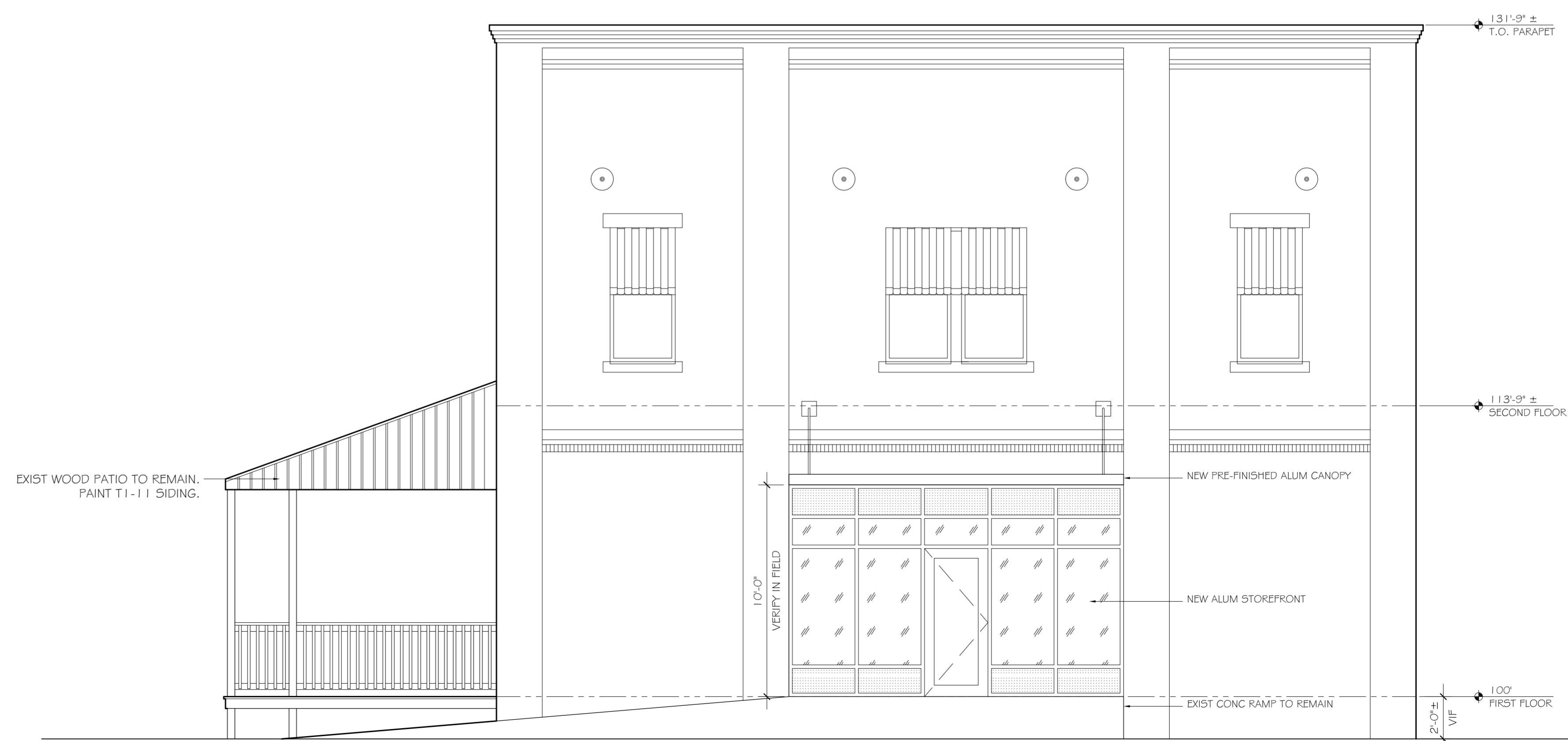
EXTERIOR ELEVATION - WEST SCALE: 1/4" = 1'-0"

EXTERIOR ELEVATION NOTES: 1. SOUTH AND EAST EXTERIOR ELEVATIONS ARE NOT SHOWN FOR CLARITY DUE TO LACK OF WORK TO BE PERFORMED.